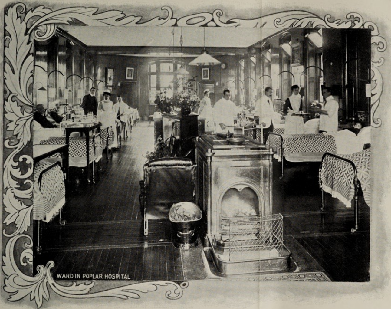
WARD IN POPLAR HOSPITAL