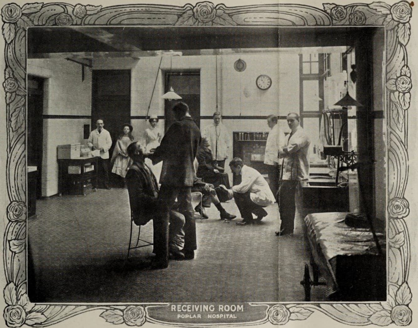
RECEIVING ROOM POPLAR HOSPITAL