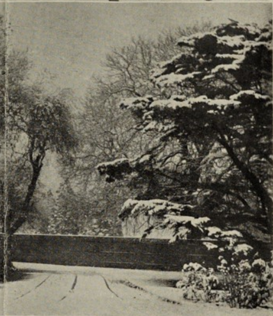
SNOW SCENES IN THE GROUNDS OF THE COLLEGE