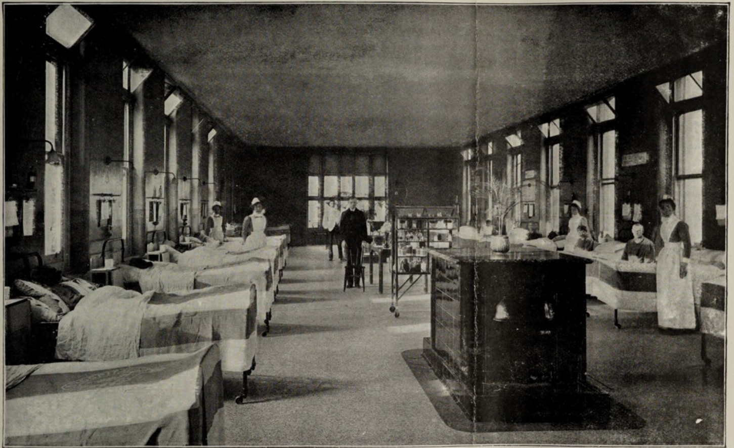
WARD IN SEAMEN'S HOSPITAL, EAST INDIA DOCKS.