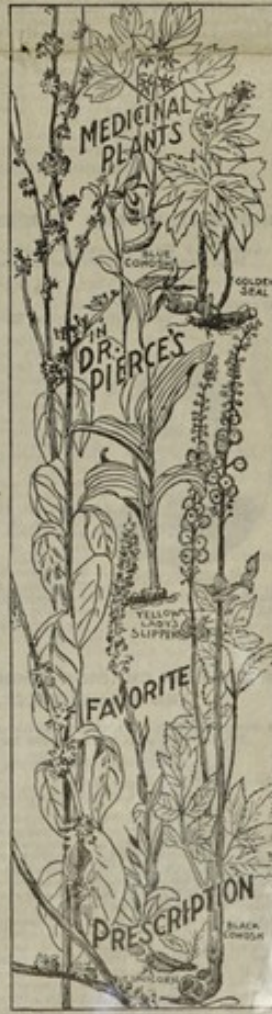
The above cut illustrates the several American forest plants, extracts from the medicinal roots of which enter into the composition of DR. PIERCE'S FAVORITE PRESCRIPTION.