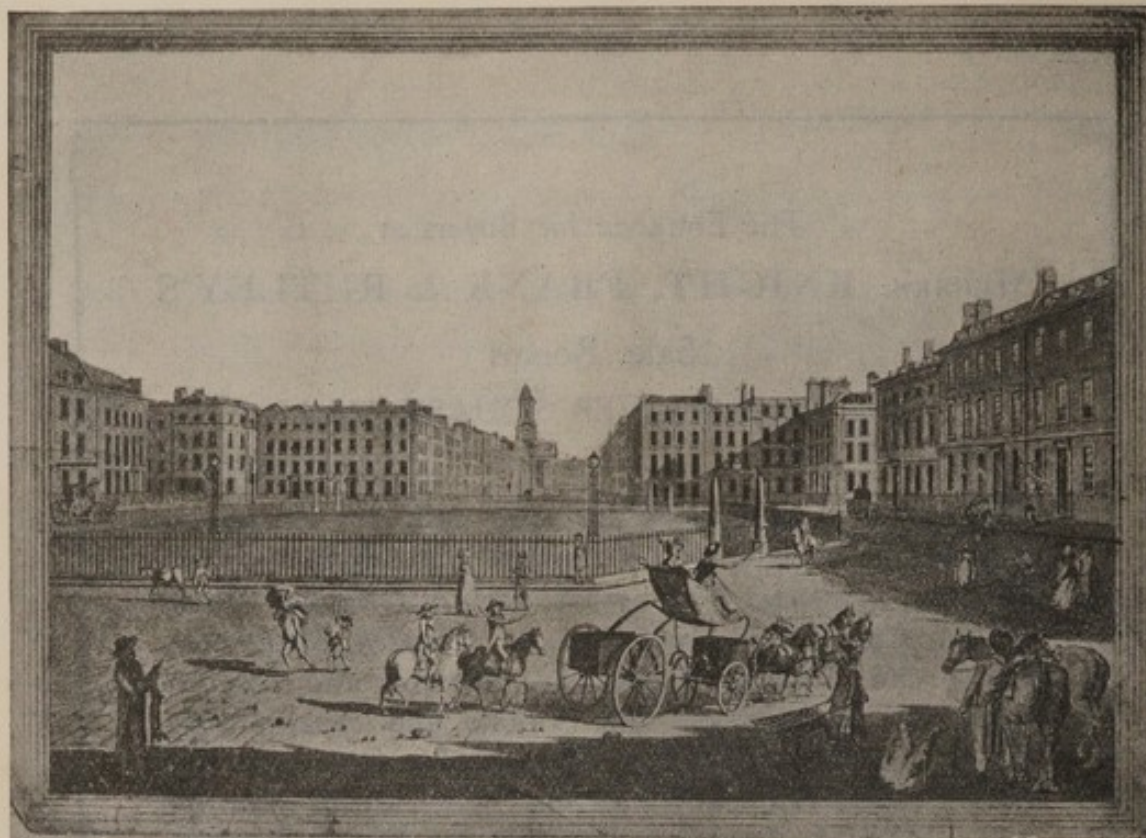
HANOVER SQUARE IN THE EIGHTEENTH CENTURY.