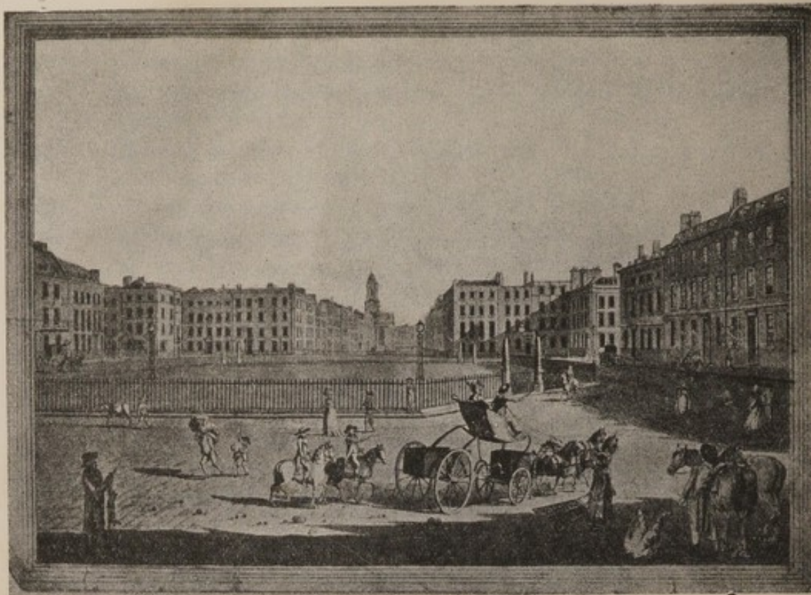
HANOVER SQUARE IN THE EIGHTEENTH CENTURY.