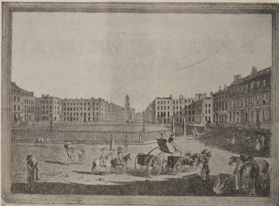
HANOVER SQUARE IN THE EIGHTEENTH CENTURY.