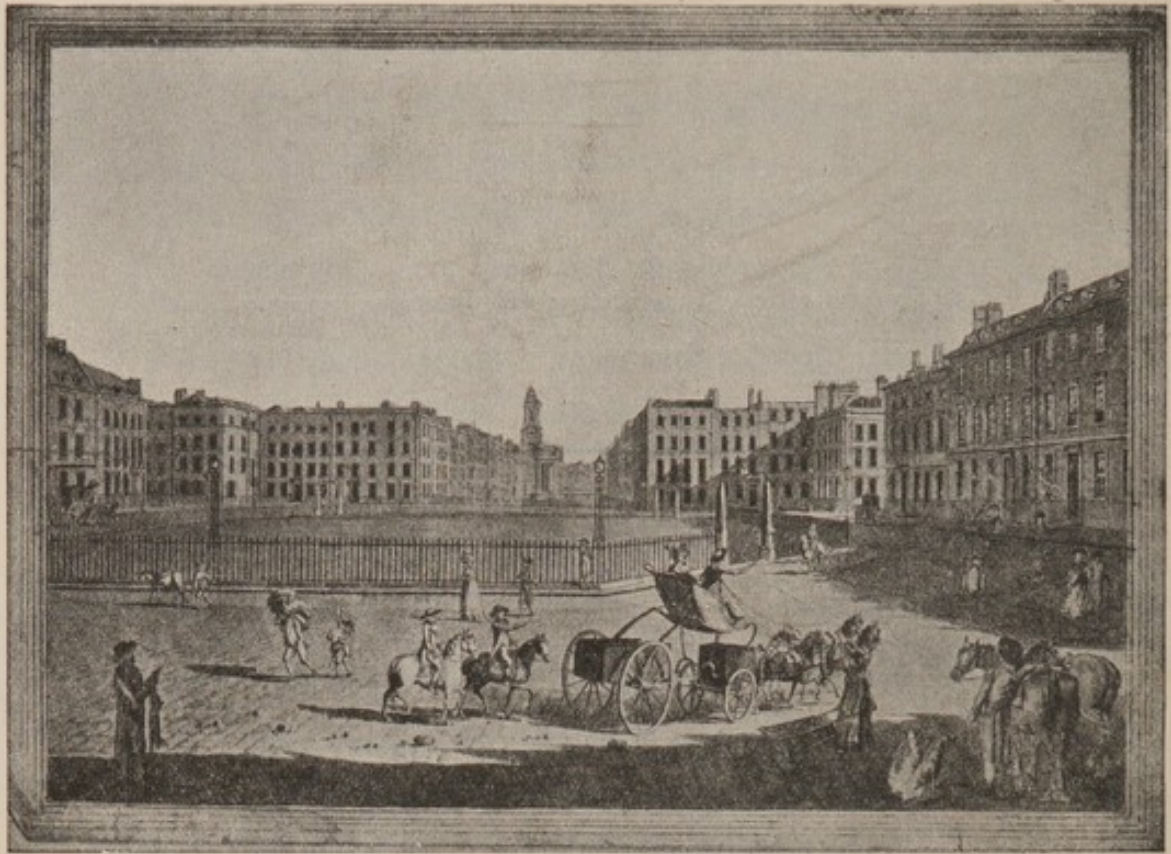
HANOVER SQUARE IN THE EIGHTEENTH CENTURY.