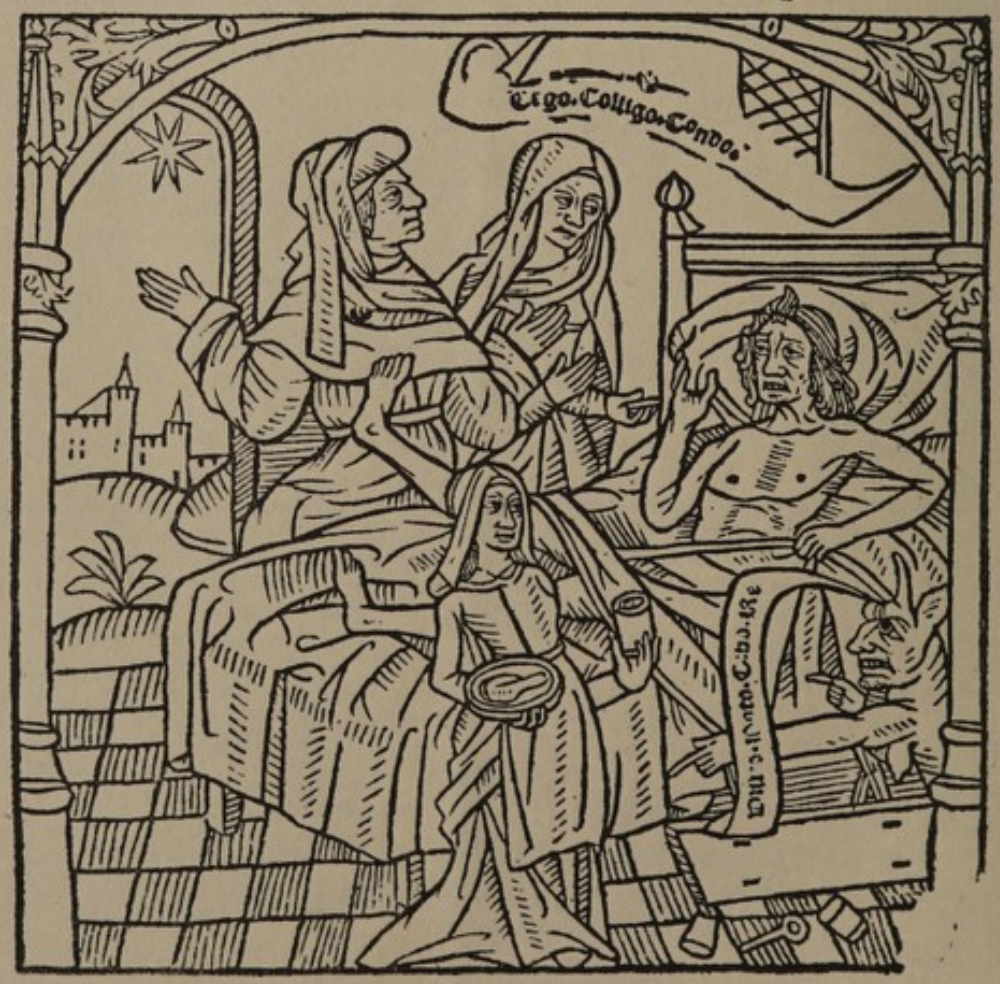
FACSIMILE OF TITLE-PAGE OF LOT 66