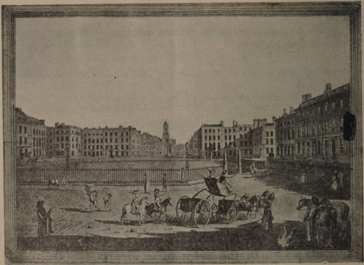
HANOVER SQUARE IN THE EIGHTEENTH CENTURY.