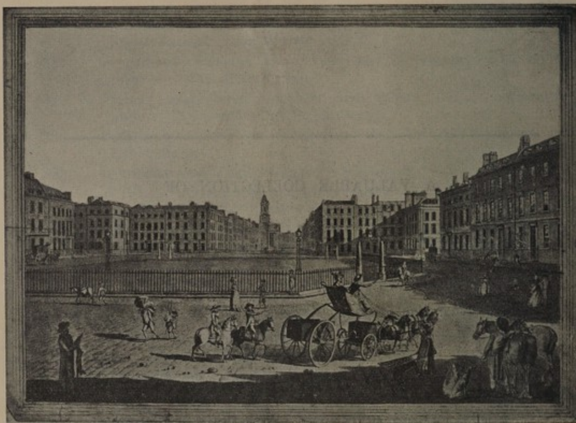
HANOVER SQUARE IN THE EIGHTEENTH CENTURY.

OWNERS DESIROUS OF INCLUDING WORKS OF ART ENGLISH AND FRENCH FURNITURE, PICTURES TAPESTRIES, JEWELS, ANTIQUE PLATE BOOKS, COINS, MEDALS, Etc., IN FORTHCOMING SALES