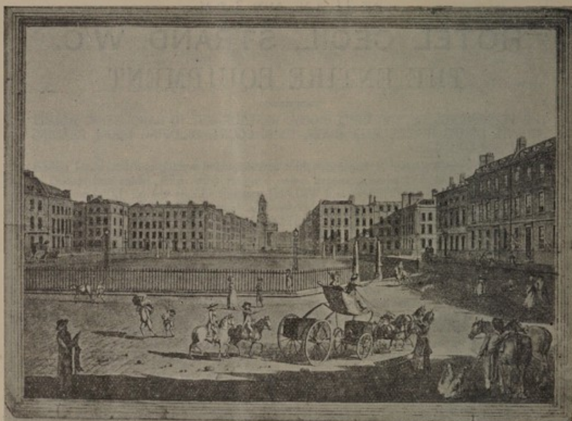
HANOVER SQUARE IN THE EIGHTEENTH CENTURY.

OWNERS DESIROUS OF INCLUDING WORKS OF ART ENGLISH AND FRENCH FURNITURE, PICTURES TAPESTRIES, JEWELS, ANTIQUE PLATE BOOKS, COINS, MEDALS, Etc., IN FORTHCOMING SALES