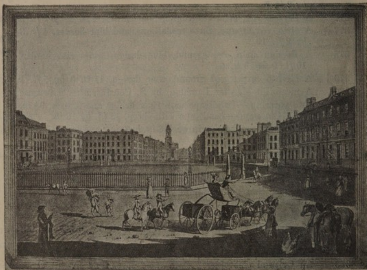
HANOVER SQUARE IN THE EIGHTEENTH CENTURY.

OWNERS DESIROUS OF INCLUDING WORKS OF ART ENGLISH AND FRENCH FURNITURE, PICTURES TAPESTRIES, JEWELS, ANTIQUE PLATE BOOKS, COINS, MEDALS, ETC., IN FORTHCOMING SALES