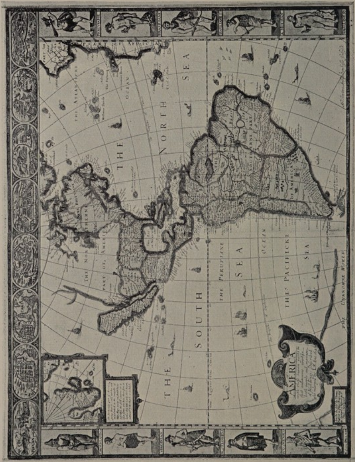
AMERICA, FROM SPEED'S ATLAS, 1676 (No. 67).