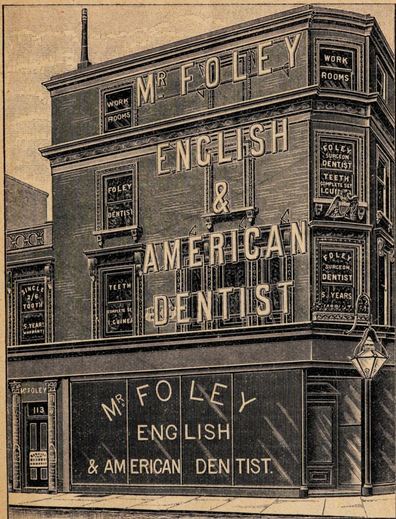
113, WESTBOURNE GROVE, W.