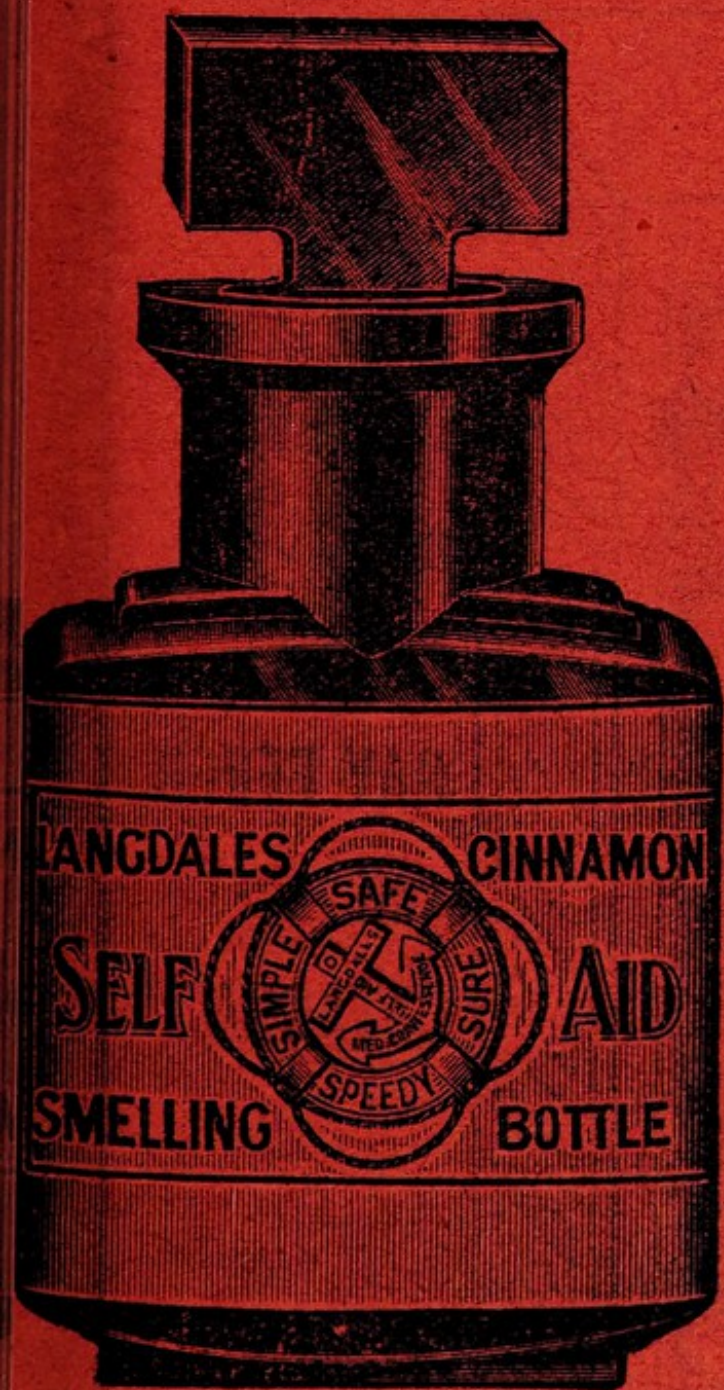
Facsimile Pocket Size

Two Sizes: "Home" 1/3; "Pocket," 1/3; Post Free 3d. extra.