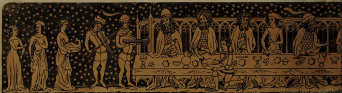
A Peacock The lower part of a Bray in the Church of S t Margare From a periodical work published by