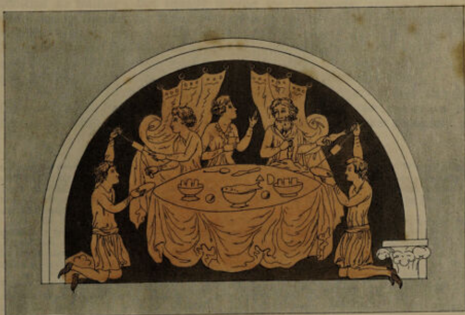
A Saxon Entertainment.

From Strutt's bojda Anſel-cynnan. Vol. I. Pl. 16. Fig. 1.