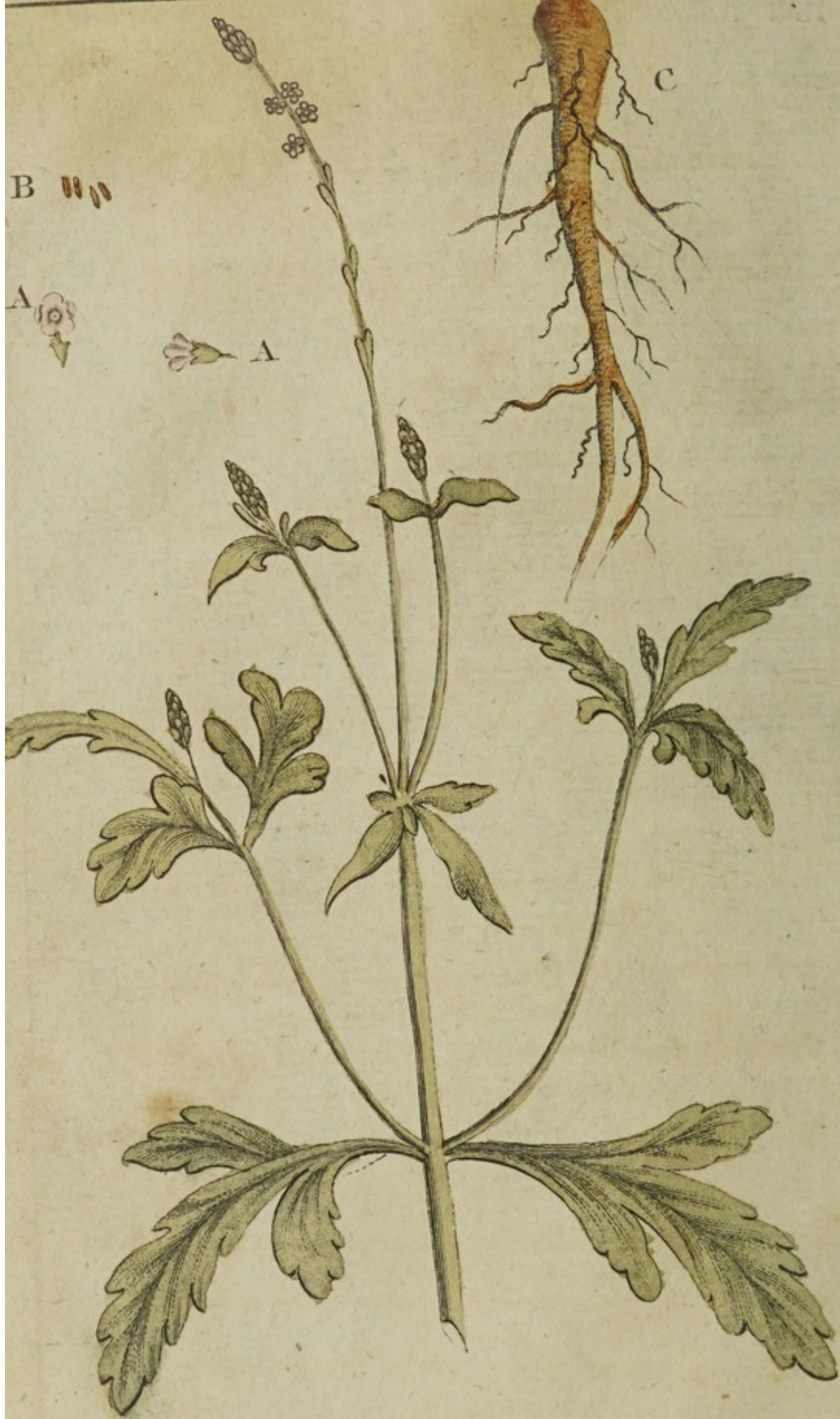
The Common Purple Vervain