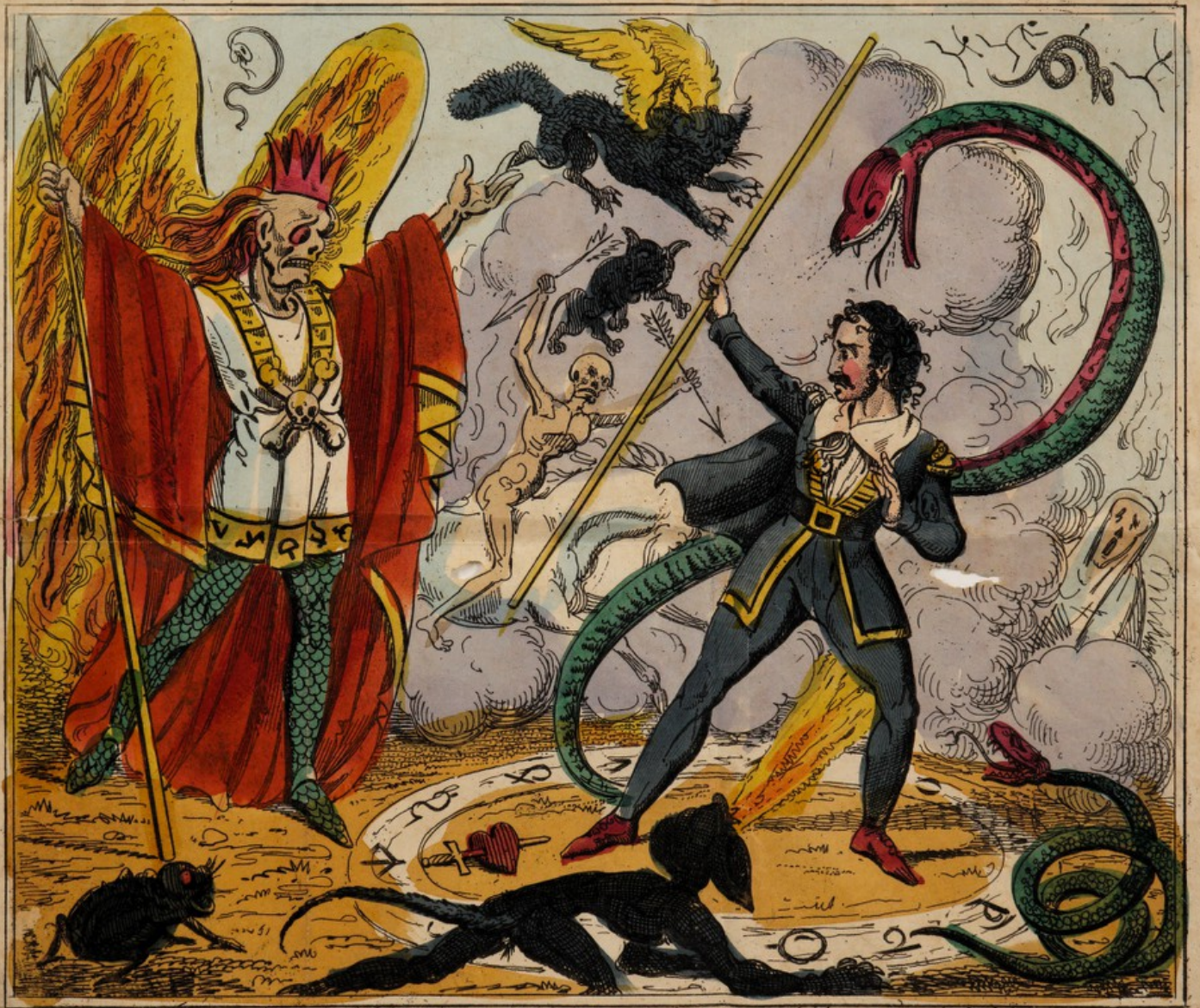
THE DEVIL AND D r . FAUSTUS.