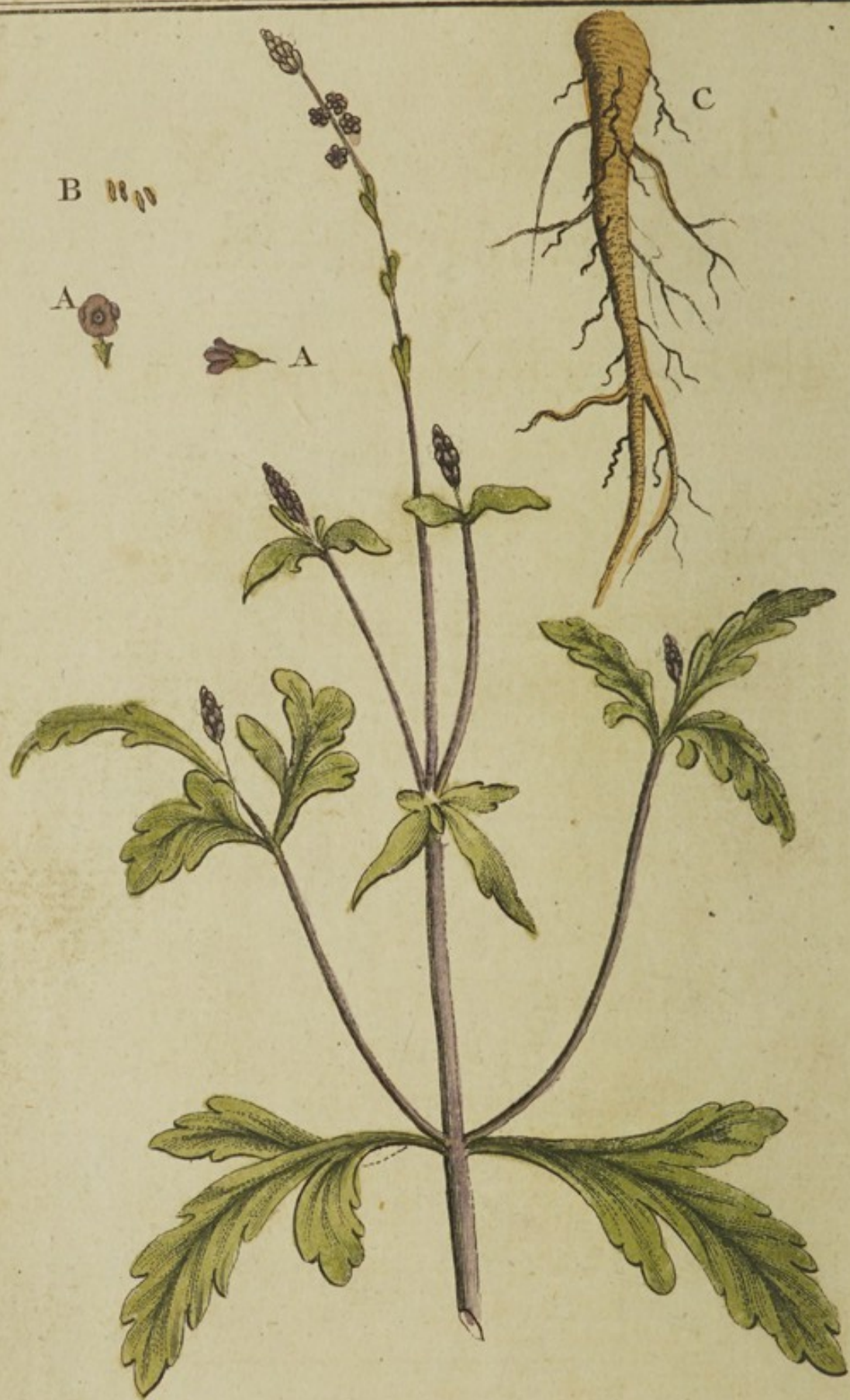
The Common Purple Vervain { Flower.....A Seed.....B Root.....C