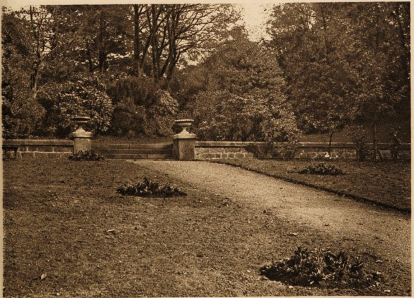
BRUNTON HOUSE GROUNDS.