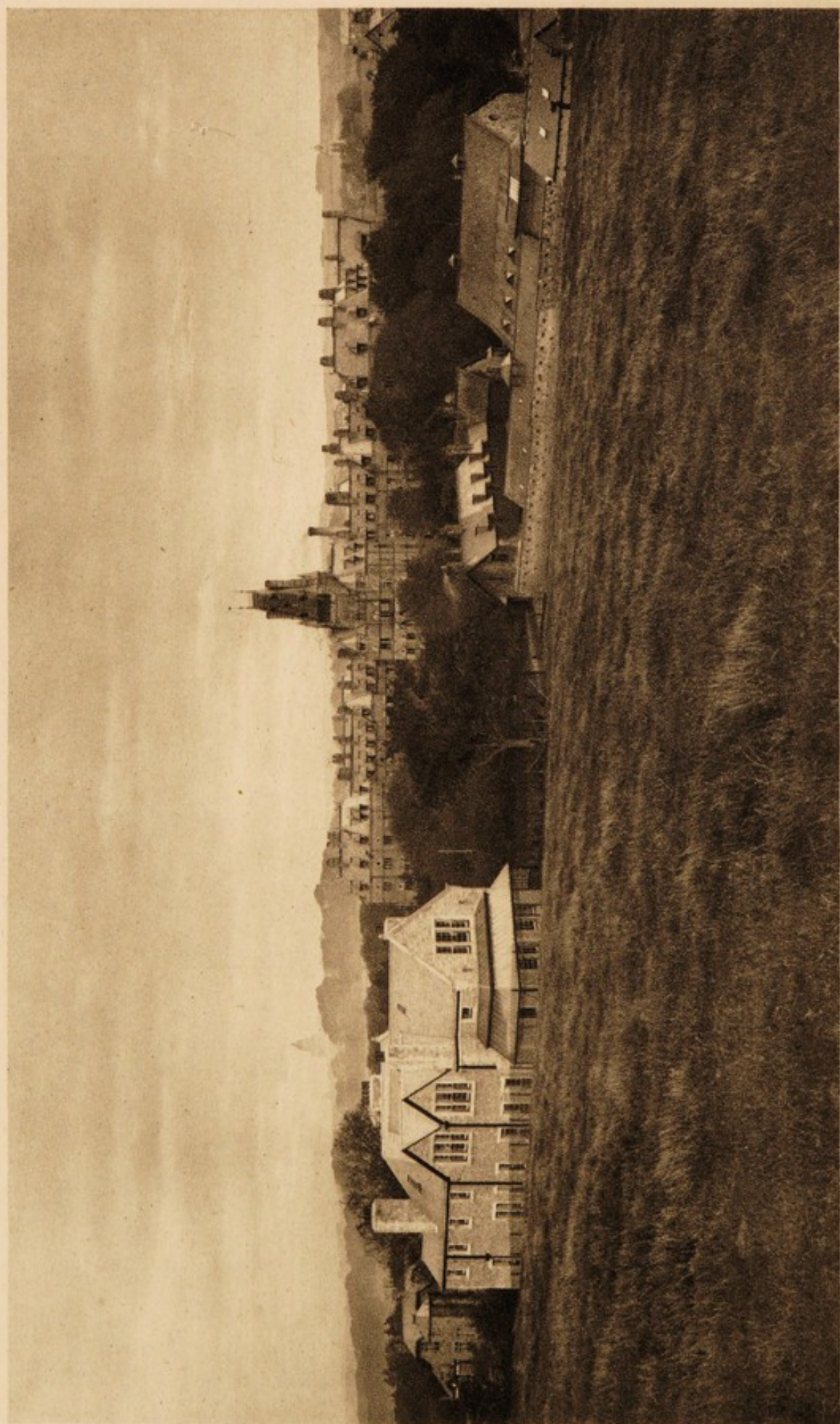
THE ROYAL ALBERT INSTITUTION.