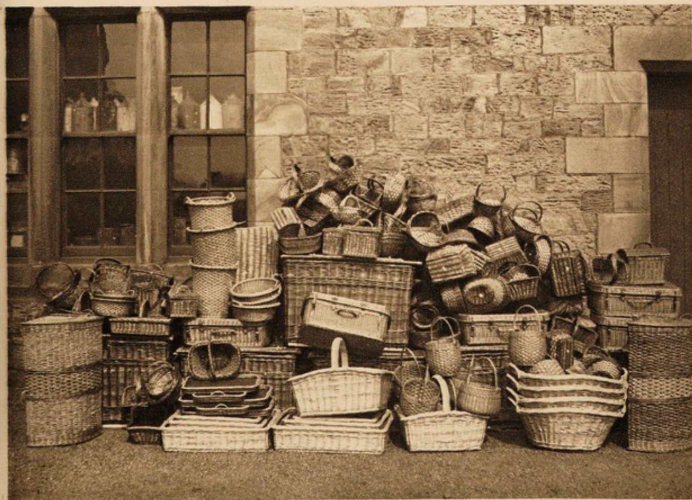
BASKETS MADE BY PATIENTS.