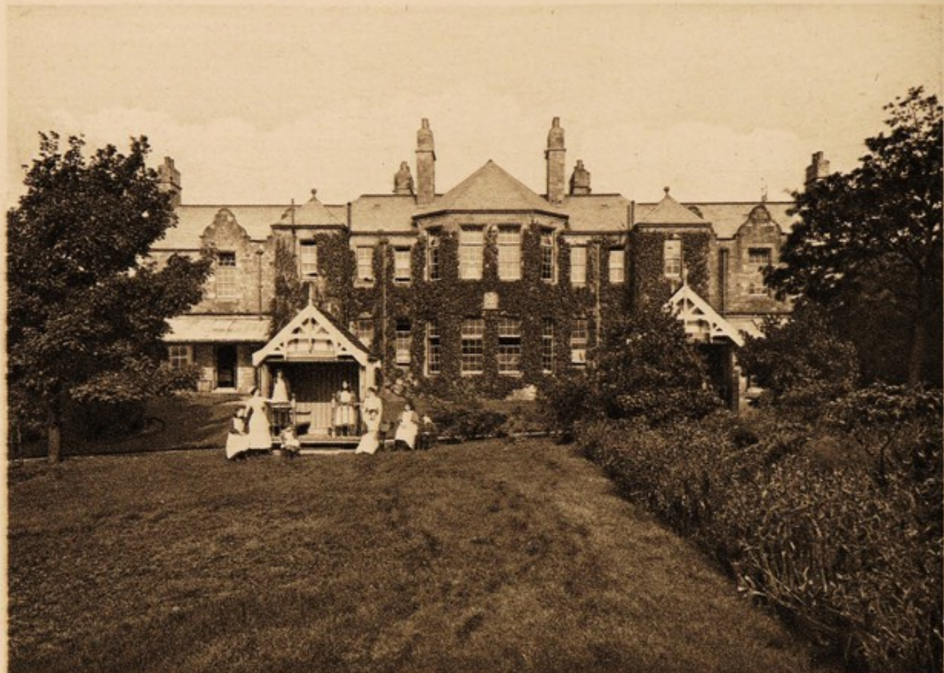
THE RODGETT INFIRMARY.