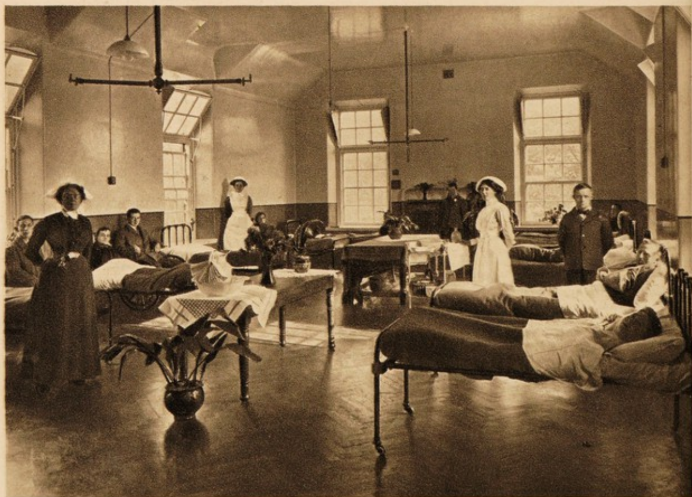
VIEW IN INFIRMARY