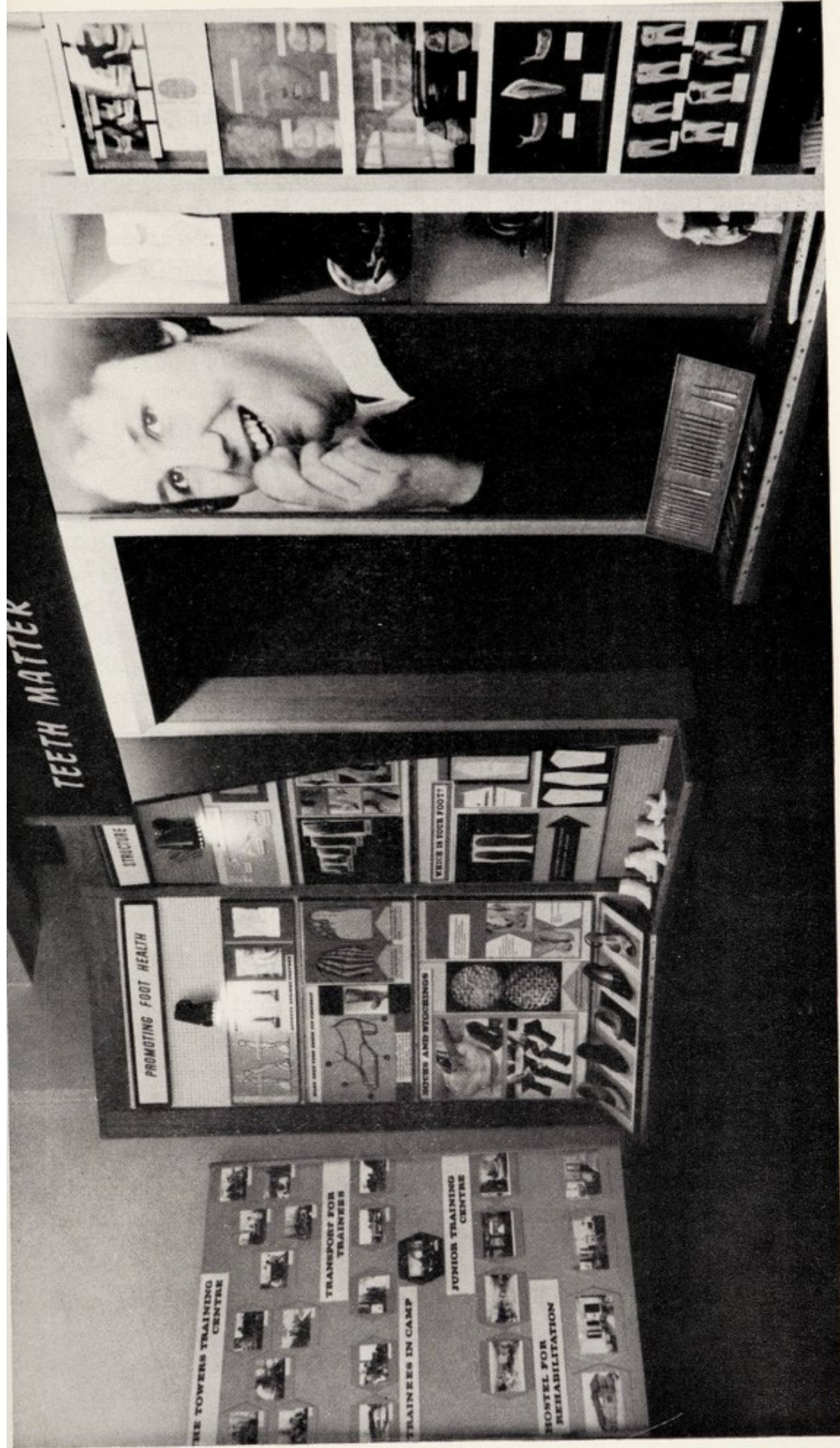
THE TOWERS EDUCATION CENTRE — EXHIBITION HALL