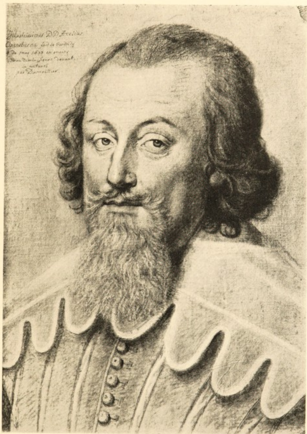
AXEL OXENSTIERNA (1583-1654)