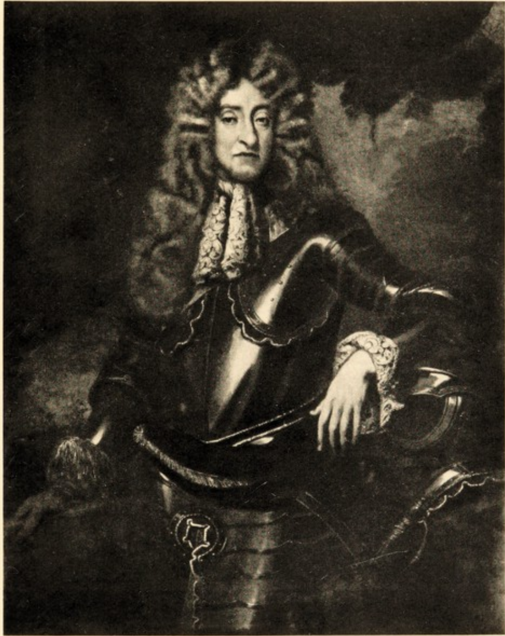
JAMES II., DUKE OF YORK