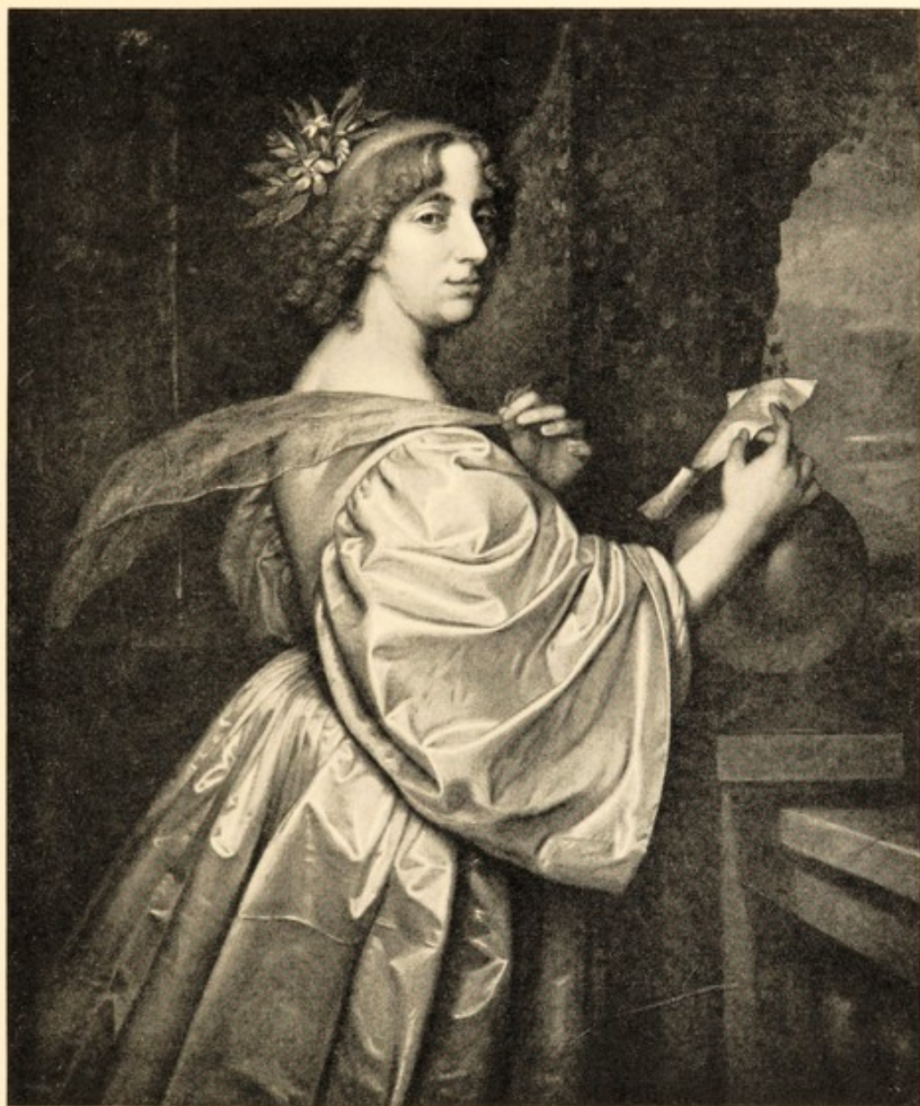
QUEEN CHRISTINA OF SWEDEN