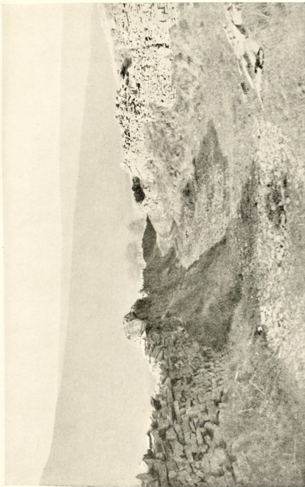
"DRY-WALLING ON THE MOORS IS A HANDICRAFT REQUIRING THE GREATEST SKILL."