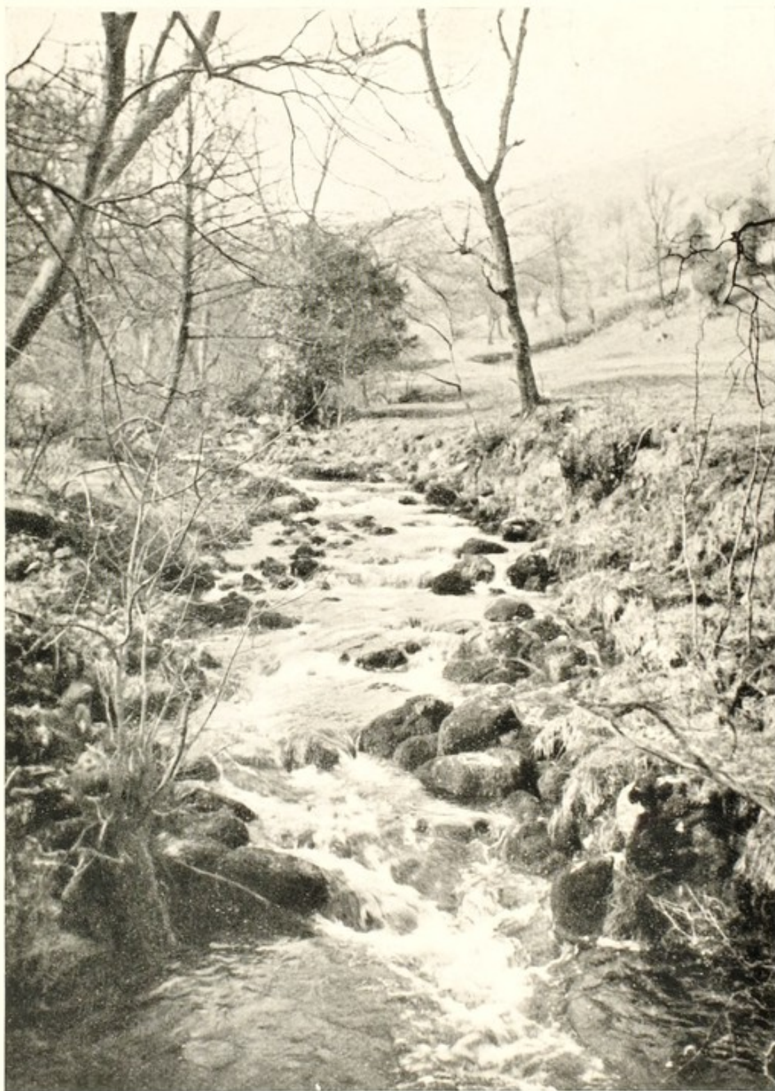
A MOORLAND BECK.