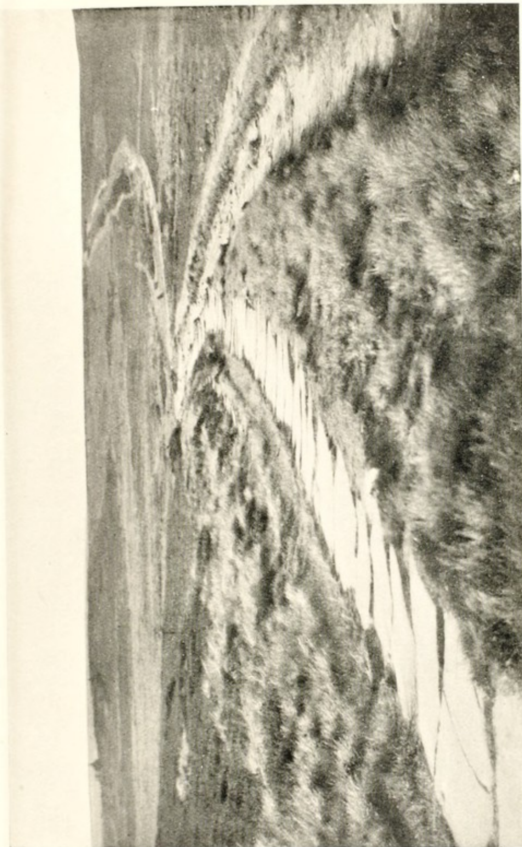
"SOME OF THE OLD PACKHORSE ROADS OVER THE MOORS . . . ARE QUITE EASY TO VERIFY."