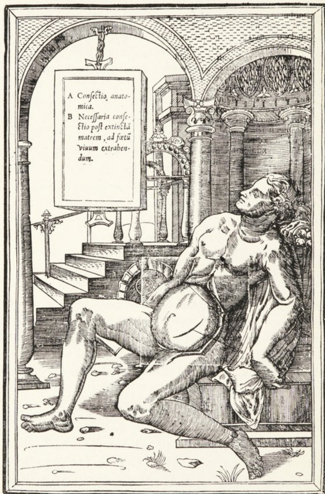
FIG. 2.—Oblique incision on left side for post-mortem Cæsarean section (C. Stephanus, 1548).