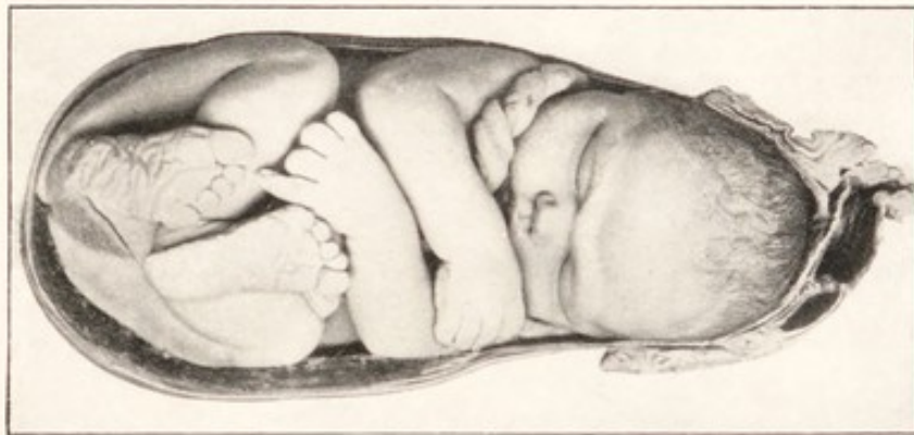
FIG. 5.—Uterus at term (left half), showing the thinness of the anterior lower segment and the small space available behind the bladder for delivery of the child through an extraperitoneal incision: author's specimen (photograph).