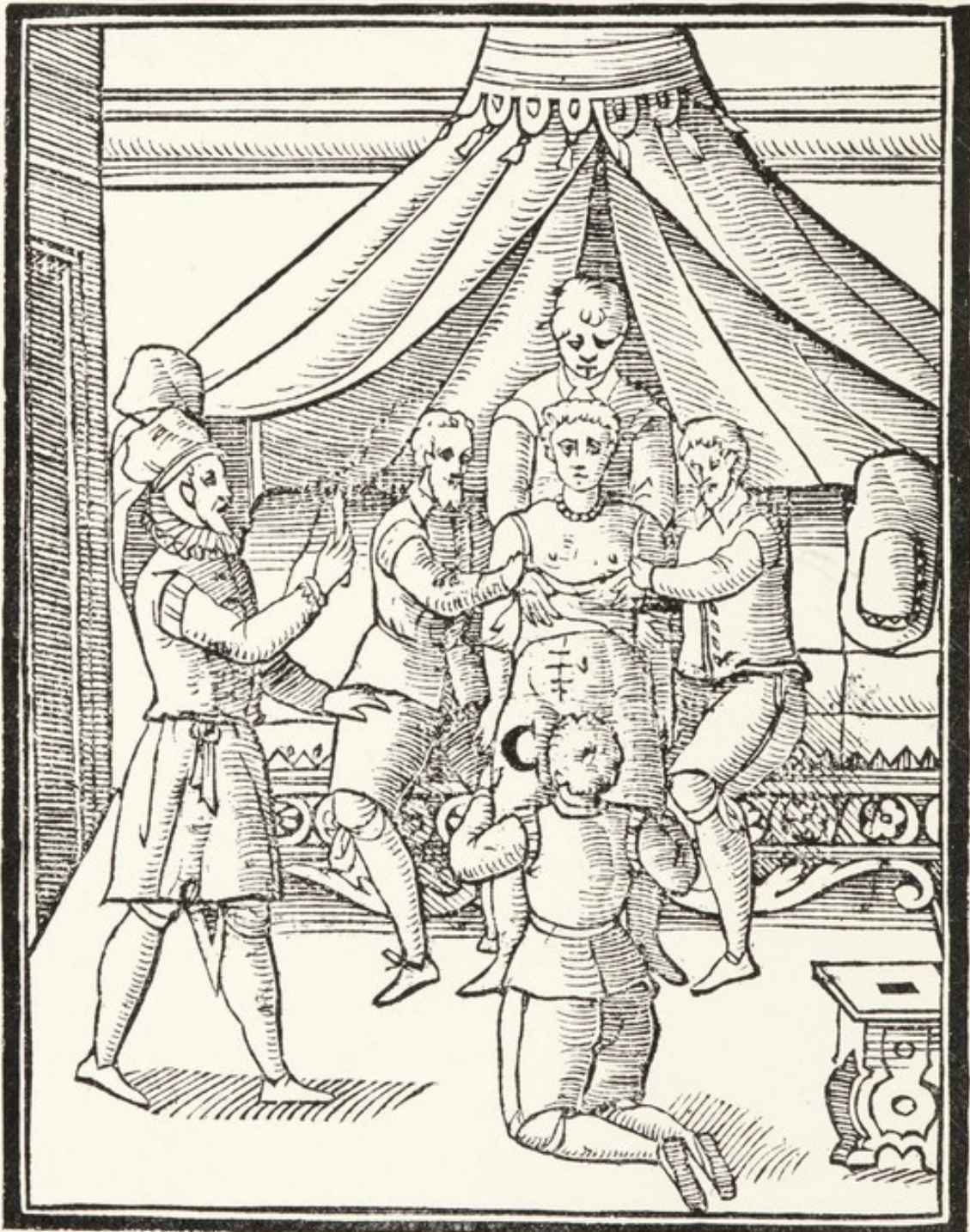
FIG. 3.—Vertical incision on right side (Scipione Mercurio, 1595).

applied to the patient's right loin presses the uterus to the middle line. The uterus is then opened in the