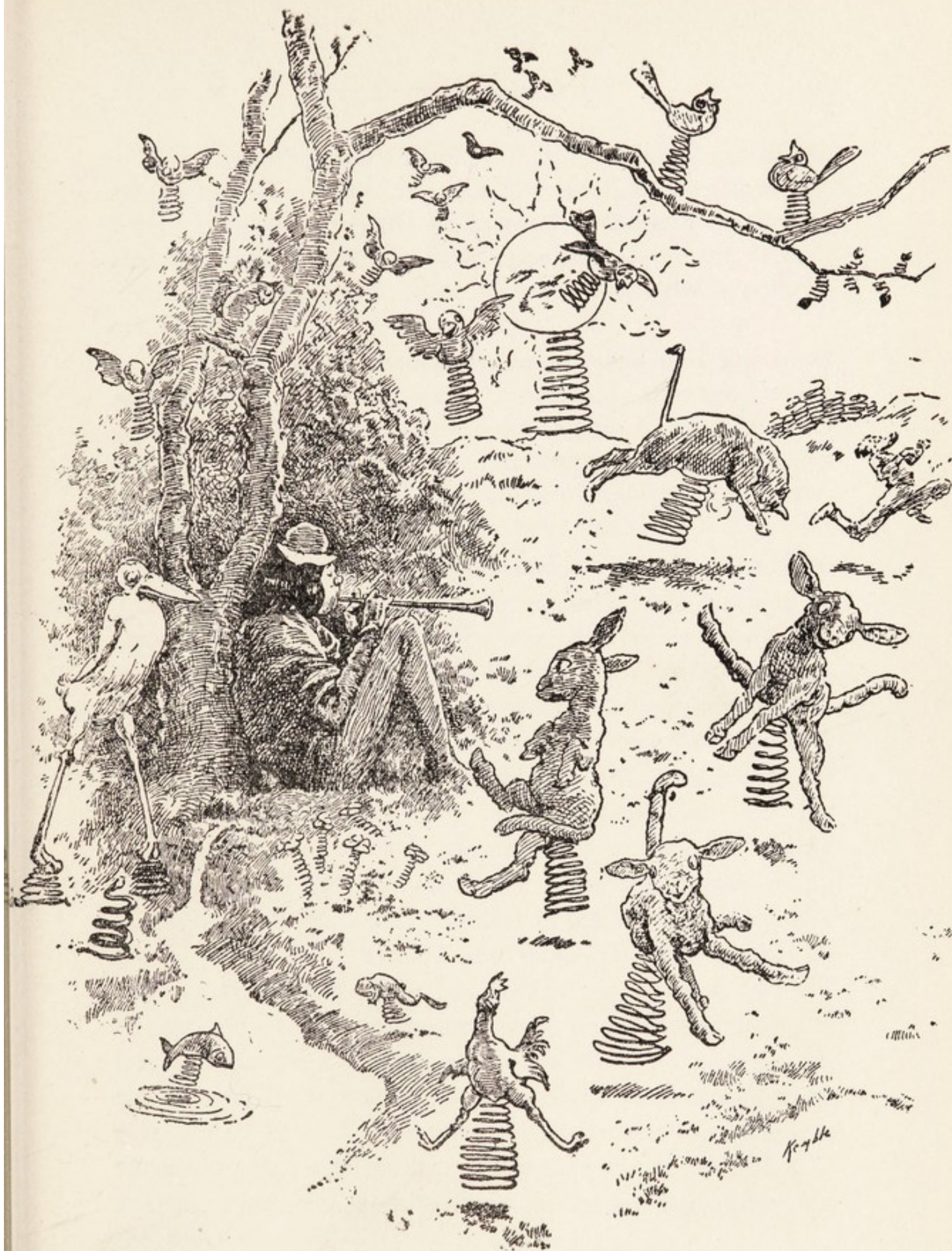
Spring, Gentle Spring