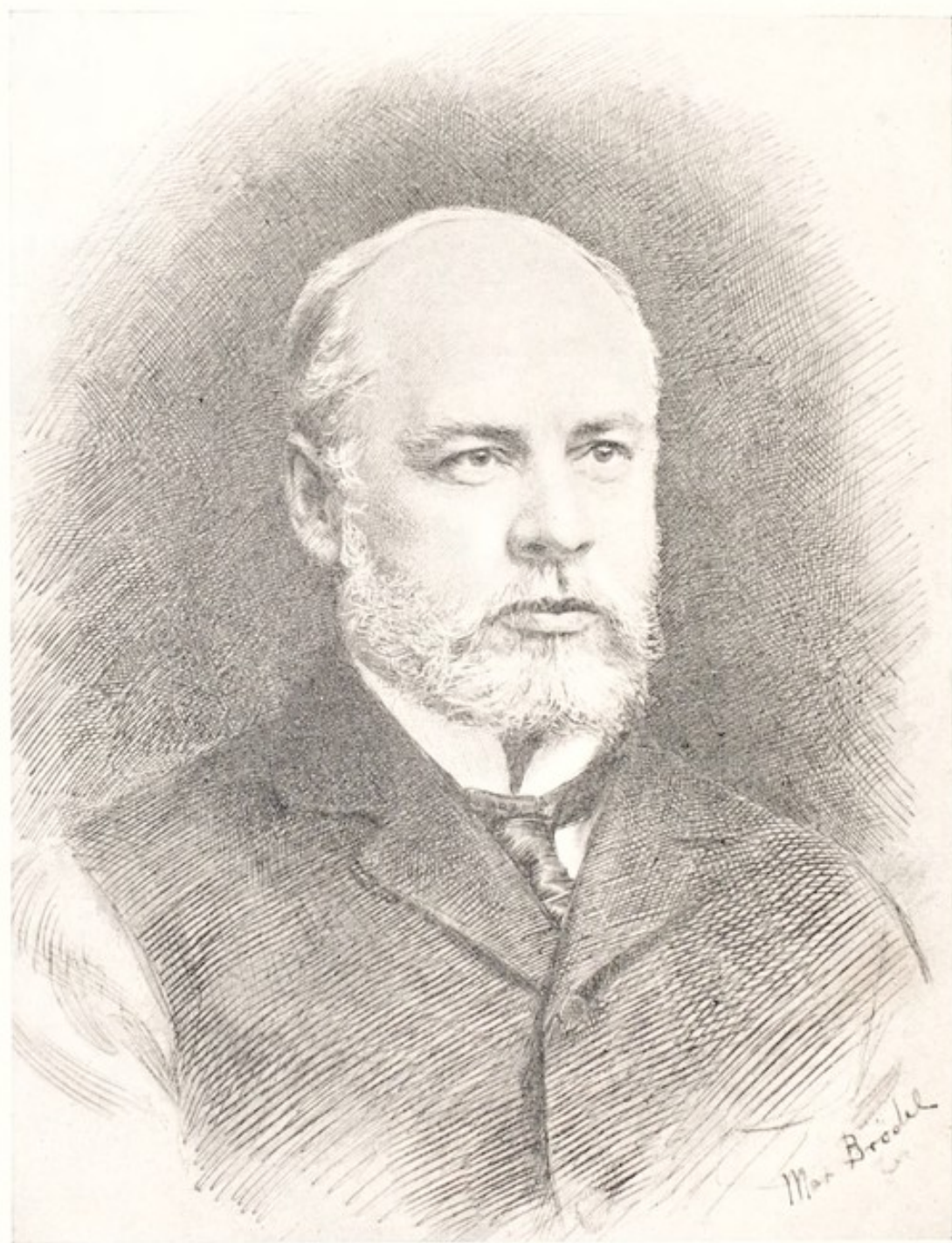
William H. Welch.