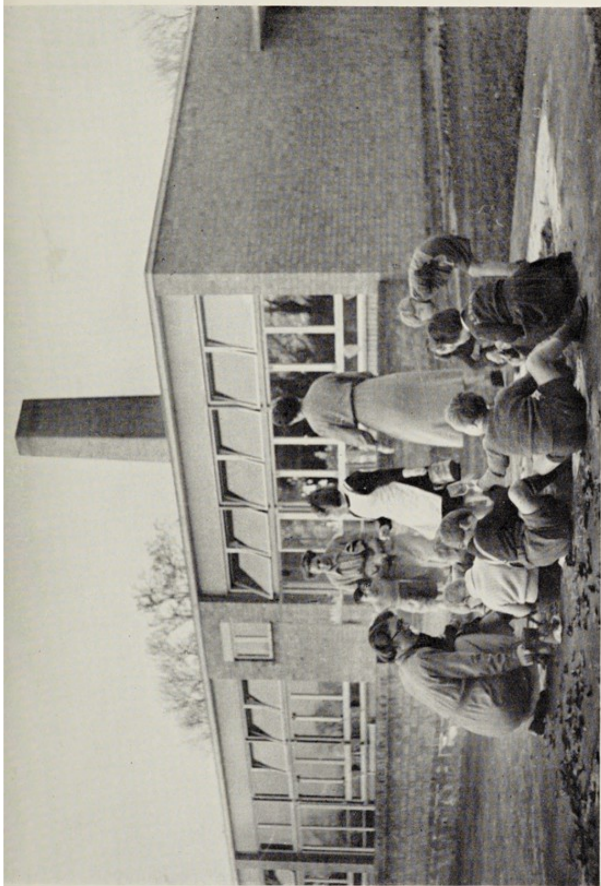
Children at play at Emily Fortey School