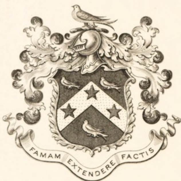
Colonel Hon ble Horace M. Monckton.