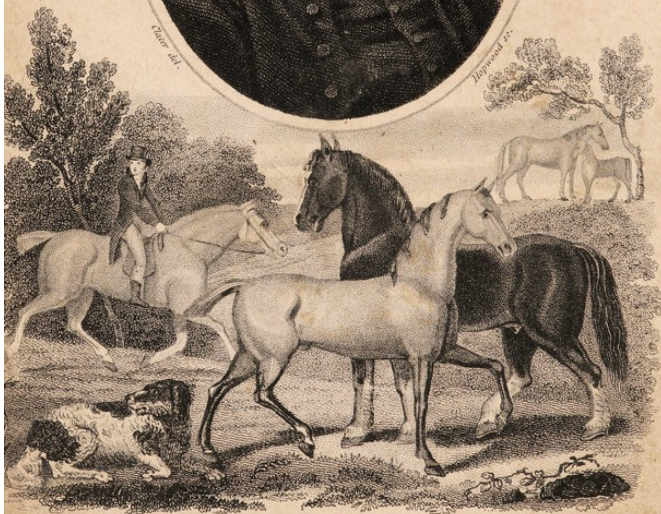
A Modern Race Horse—A Roadster, & a Draught Horse.