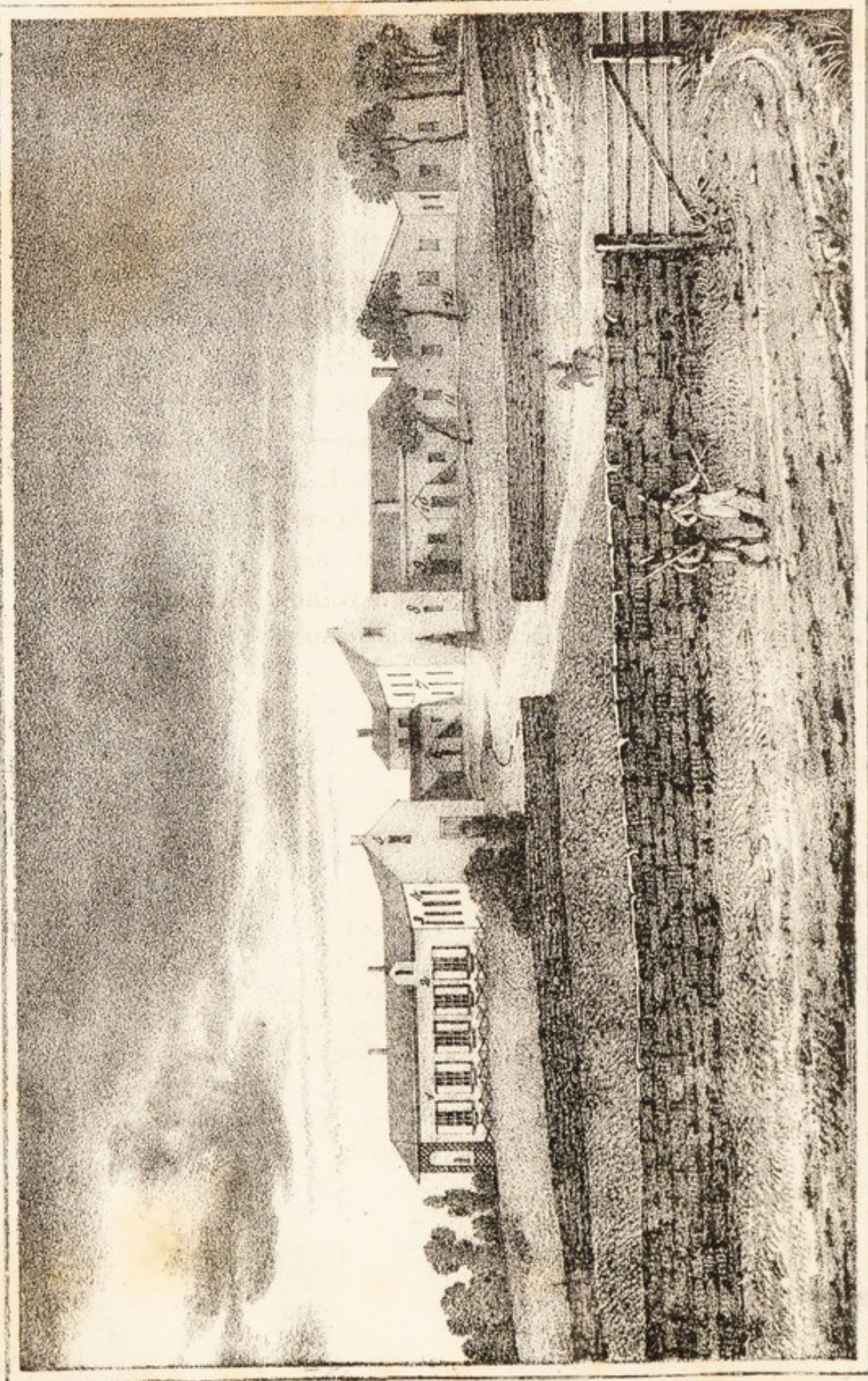
The house in which the Emperor Napoleon expired after a confinement of nearly six years.