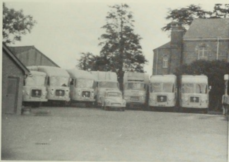
Refuse collection and cesspool emptying vehicles.