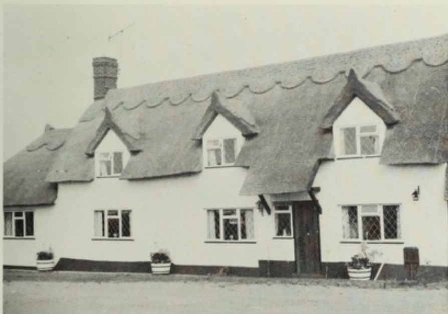
Dwelling after carrying out repairs and improvements.