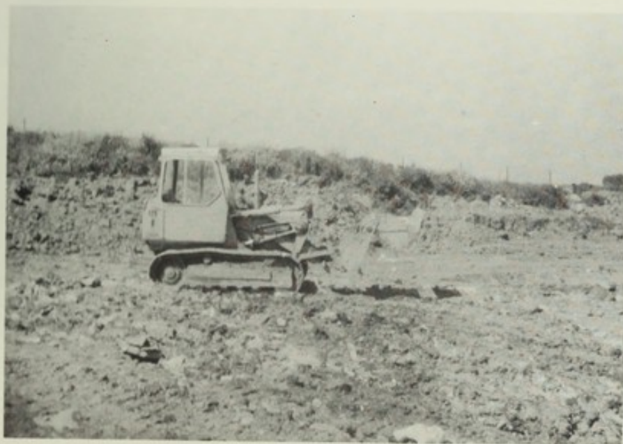
Tractor shovel on refuse tip.