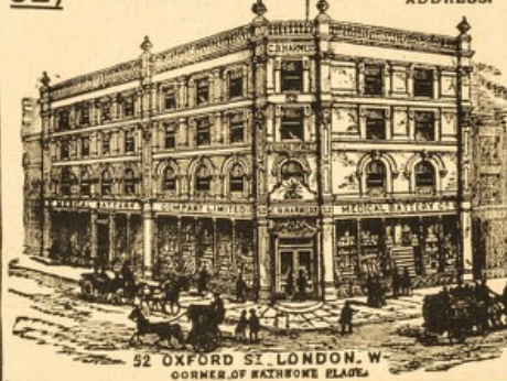
52 OXFORD ST. LONDON, W. CORNER OF RATHBONE PLACE.