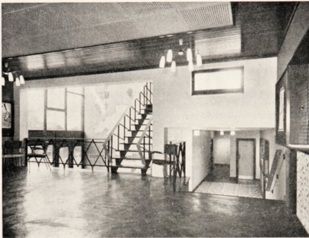
THE FIRS CENTRAL CLINIC ENTRANCE HALL