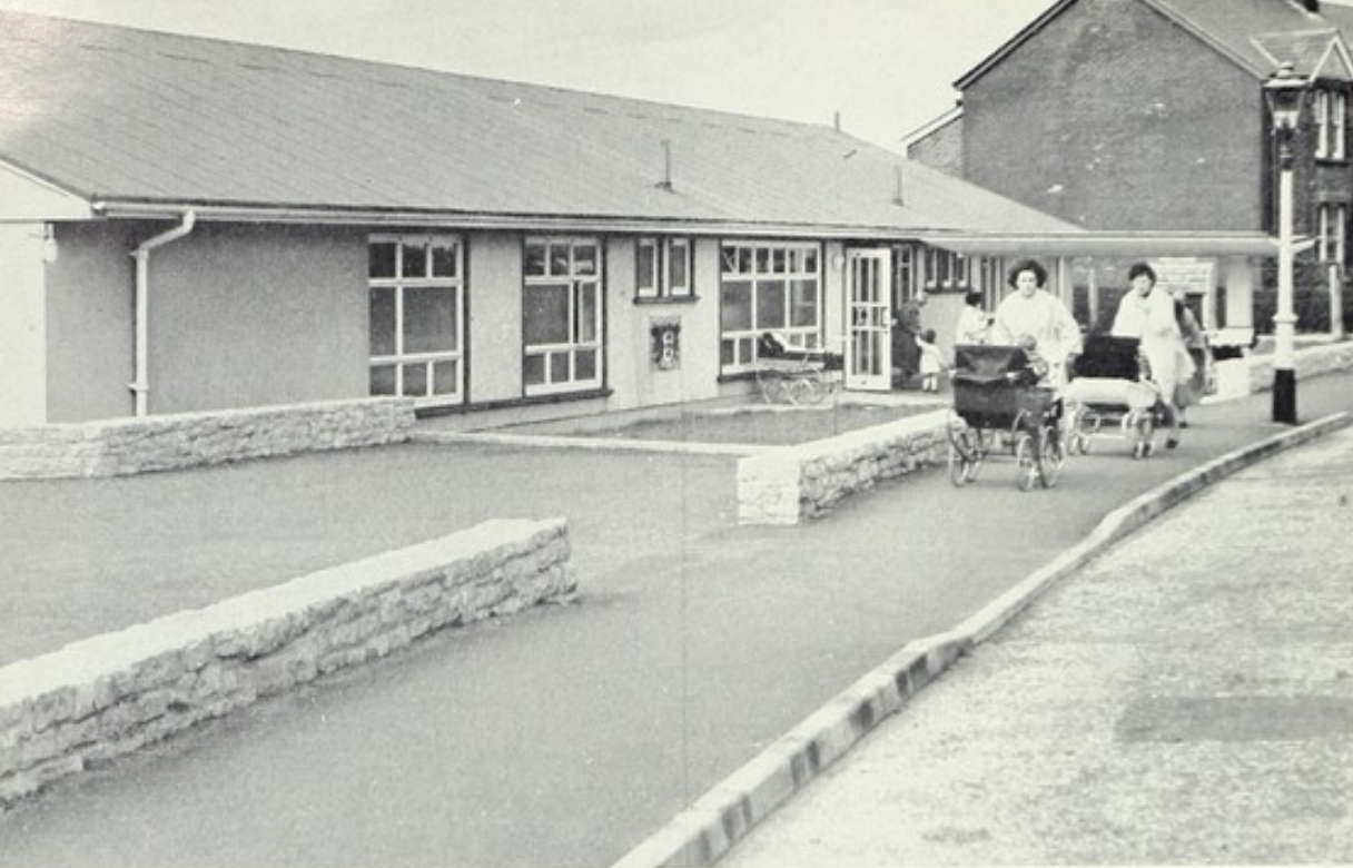
BRANKSOME CLINIC, POOLE, brought into use on 10th April, 1961.