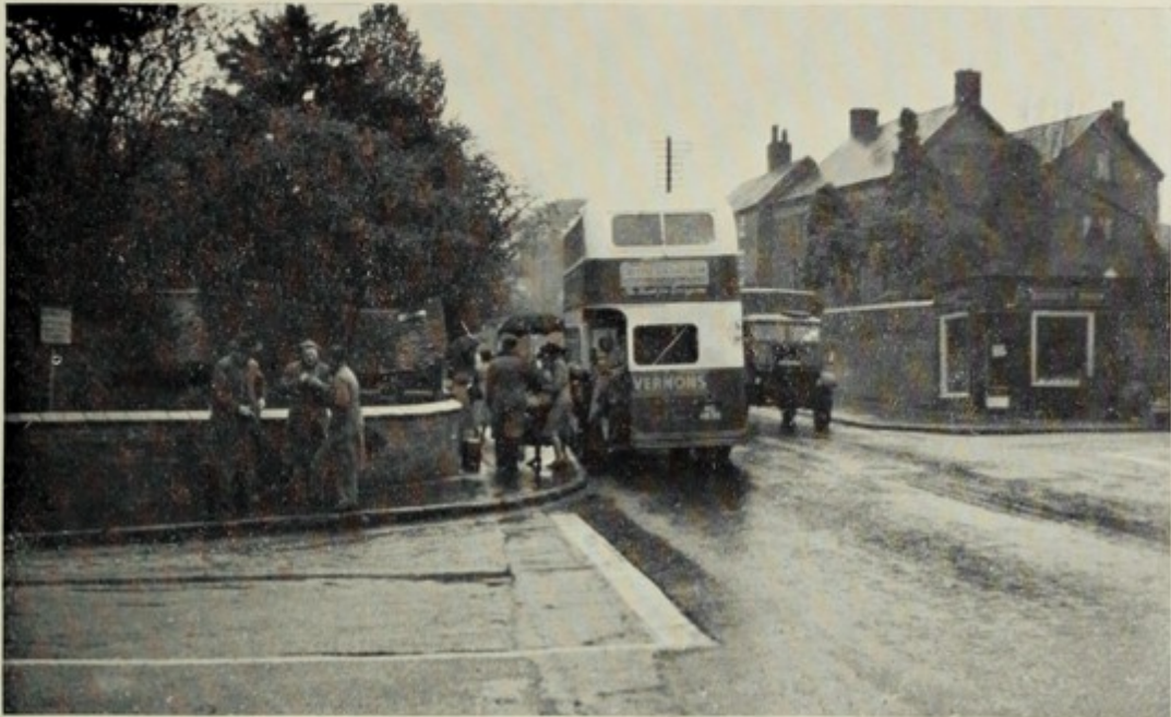
(1) Showing junction of Delven Lane and High Street, Castle Donington before alterations.