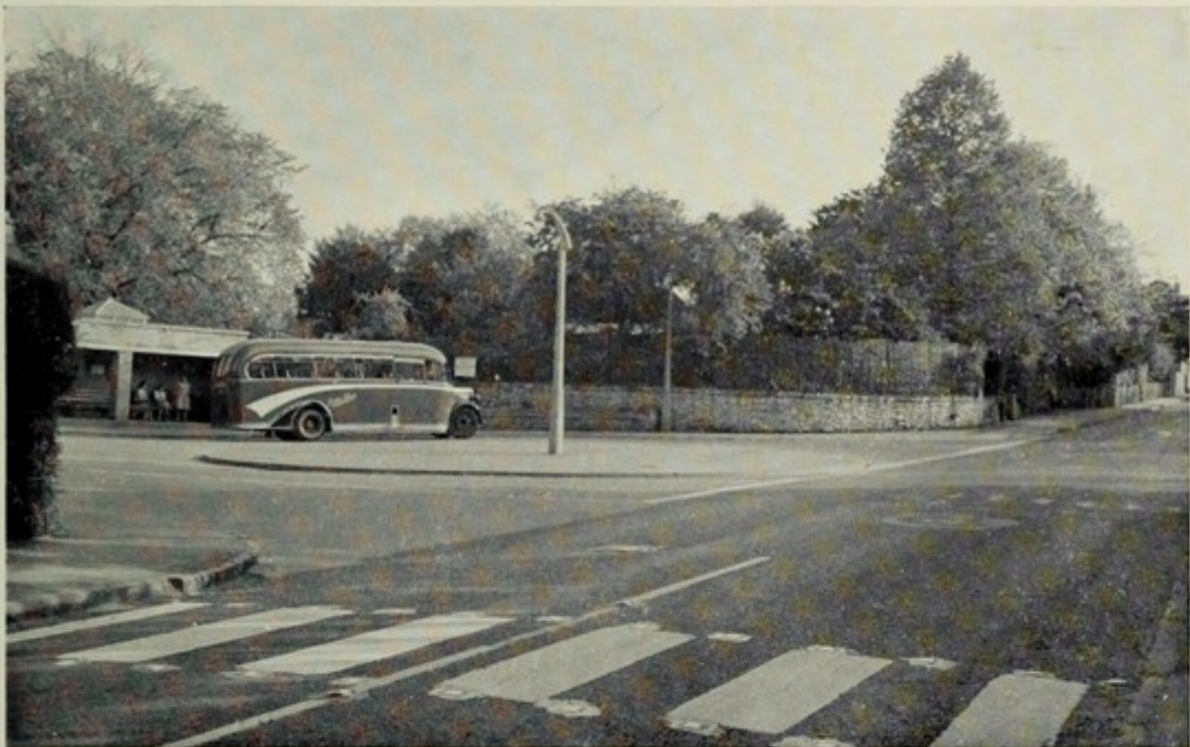
(2) Taken from High Street, Castle Donington showing Bus Station and Shelter.