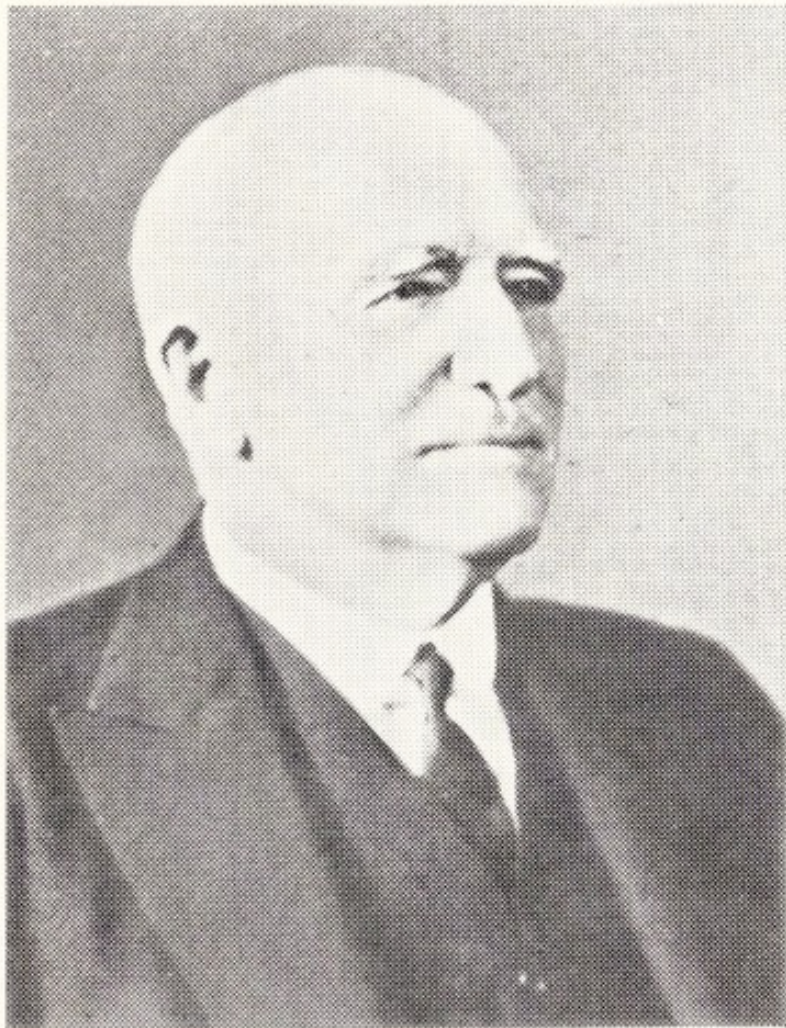
HENRY S. WELLCOME