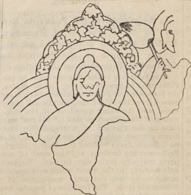
Figures from the niche of the sitting idol (infant idol.)