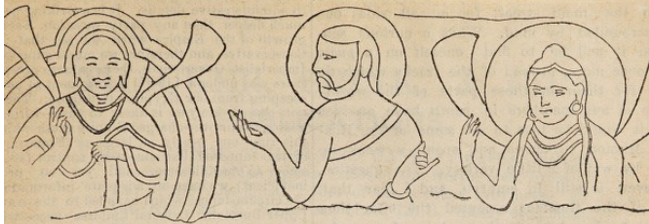
Figures from roof of the niche of the 2nd (female) idol.