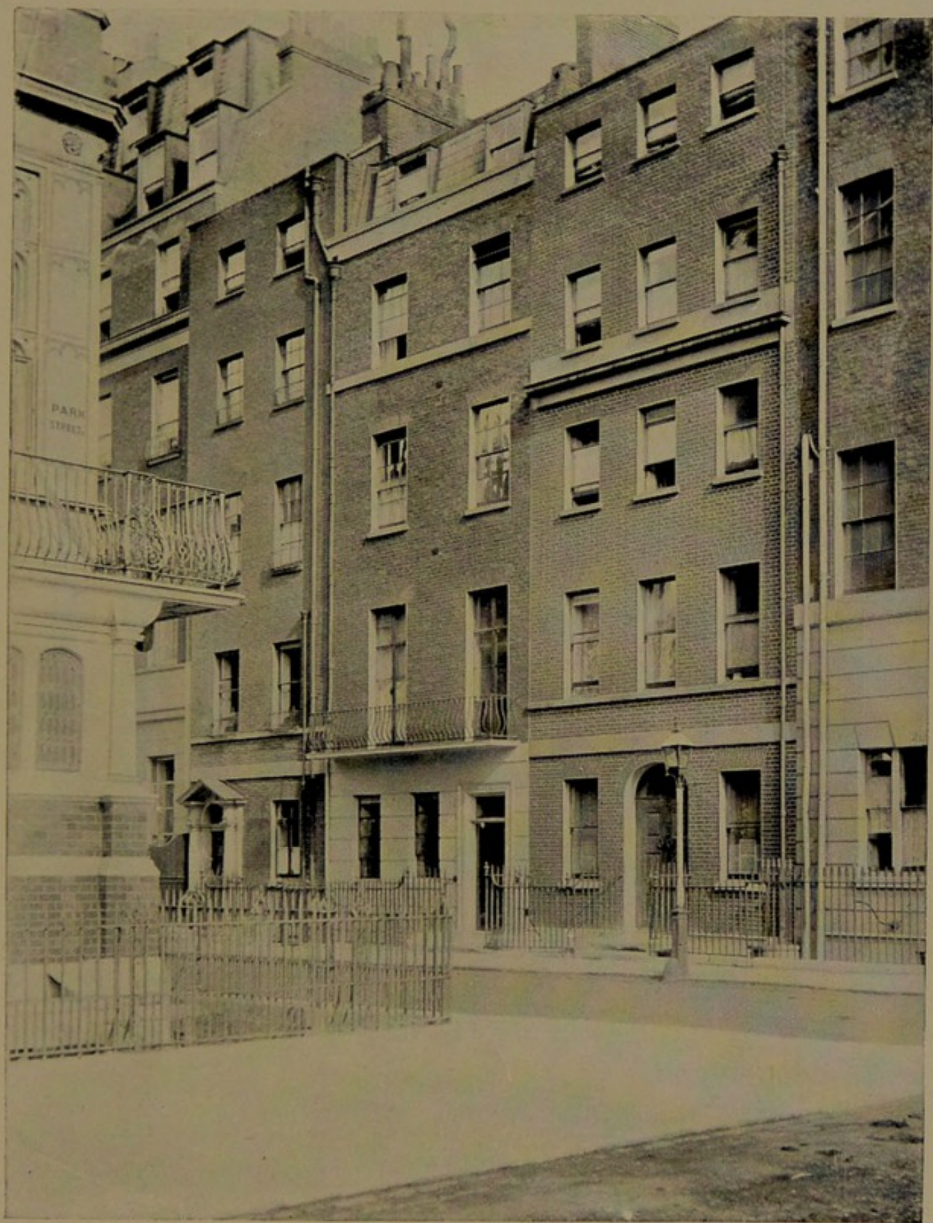
Florence Nightingale's London House, 10 South Street, Park Lane (house with balcony), where she died, August 14, 1910.