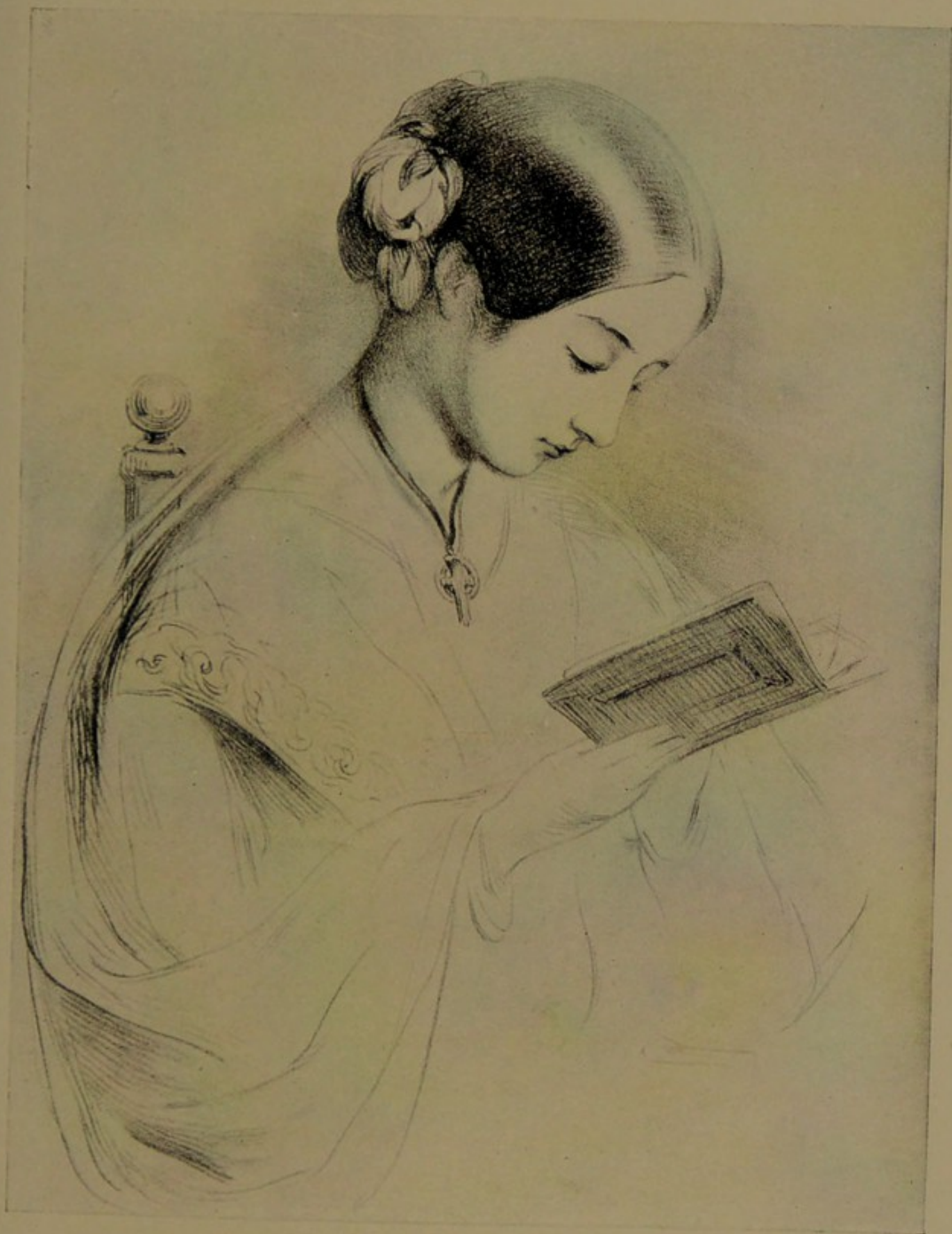
Florence Nightingale in 1854.