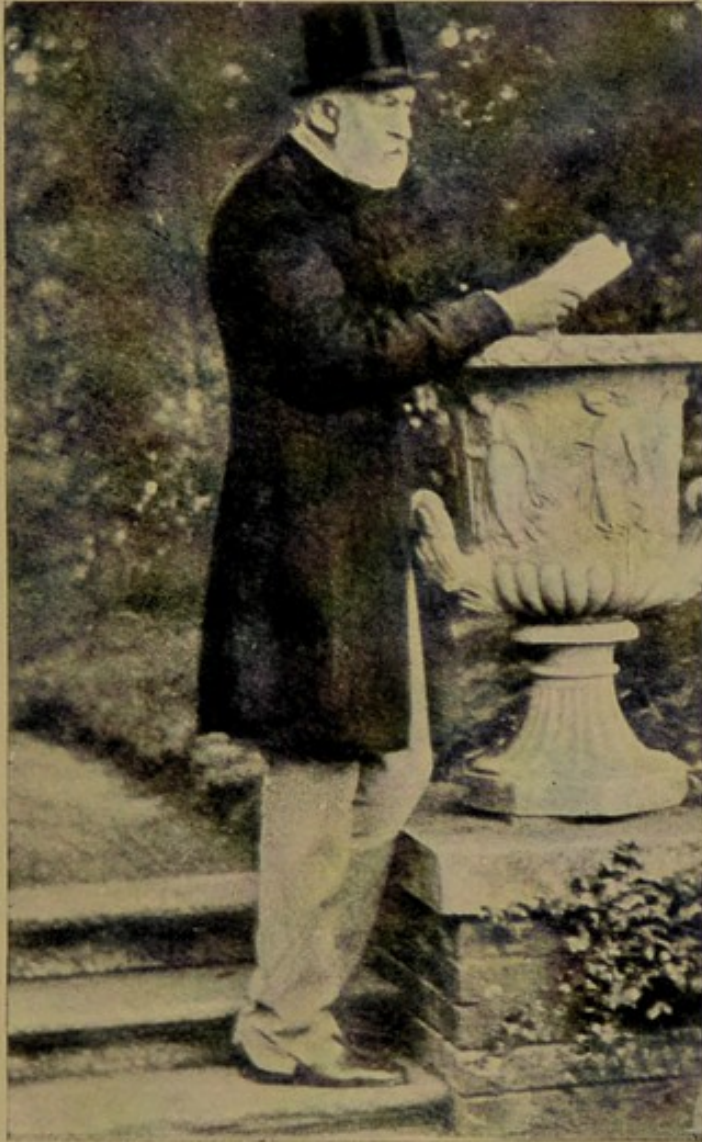
Florence Nightingale's Father.