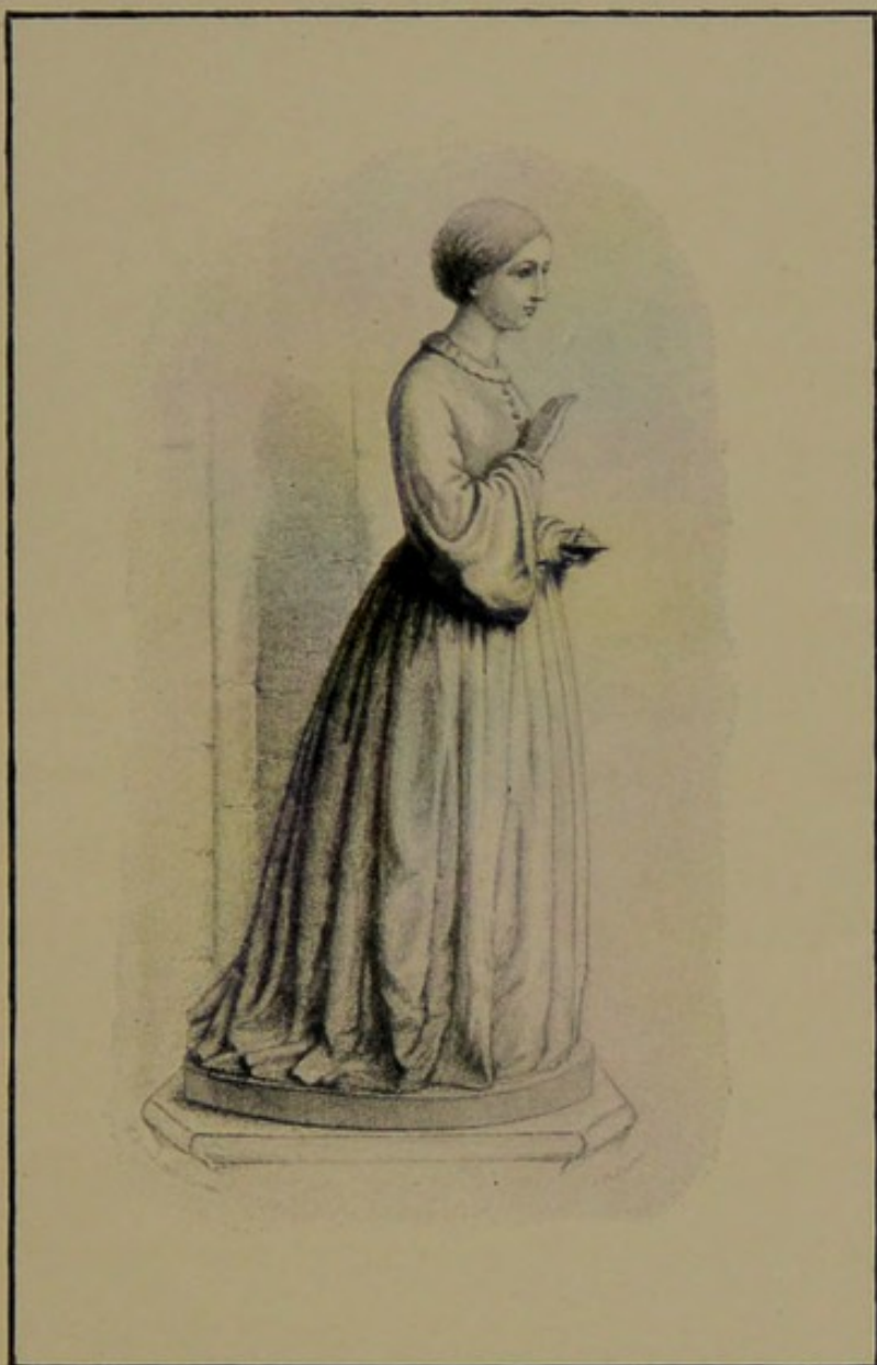
“The Lady with the Lamp.” (From the statuette in the Nightingale Home .)