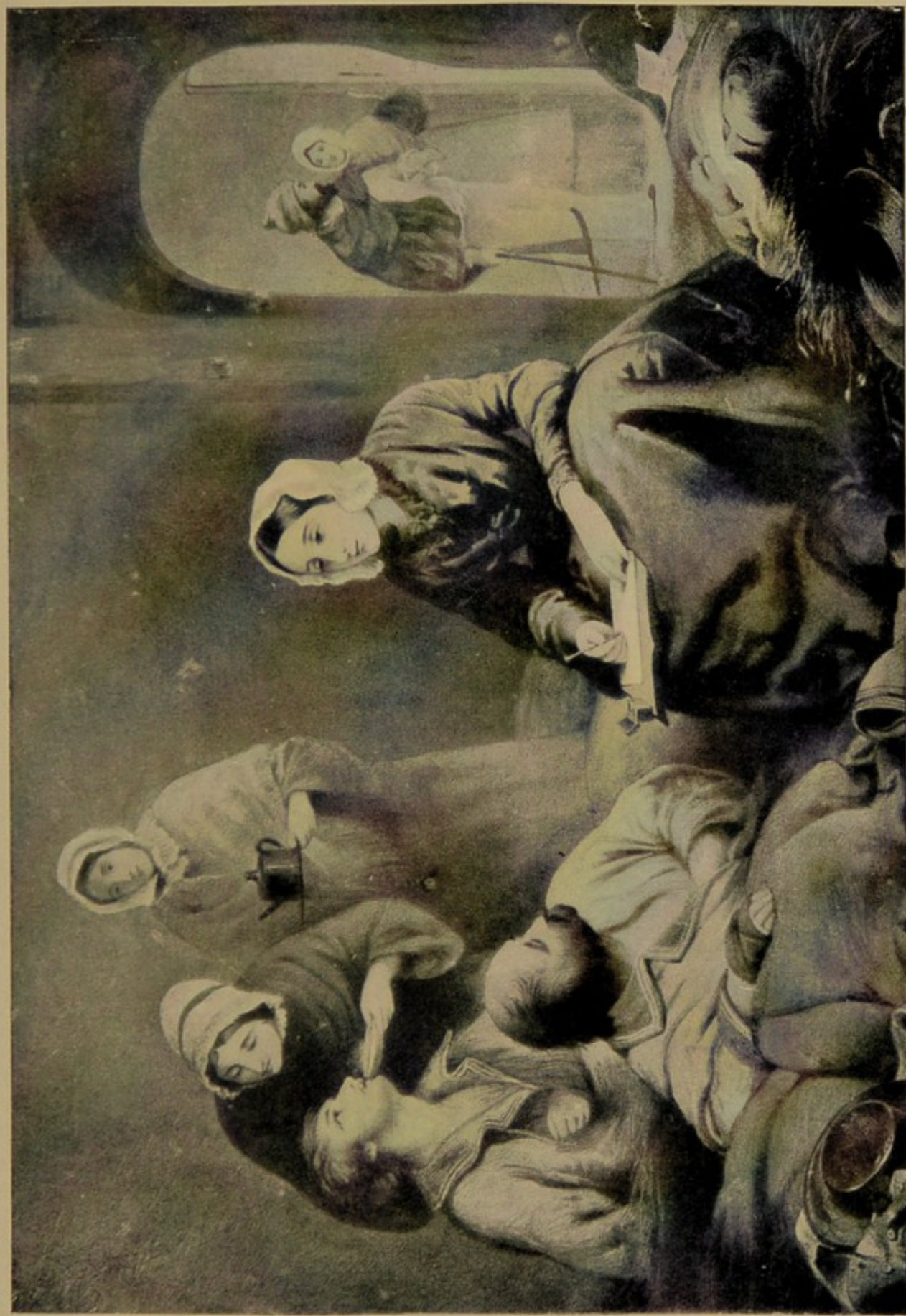
Florence Nightingale at the Therapia Hospital.