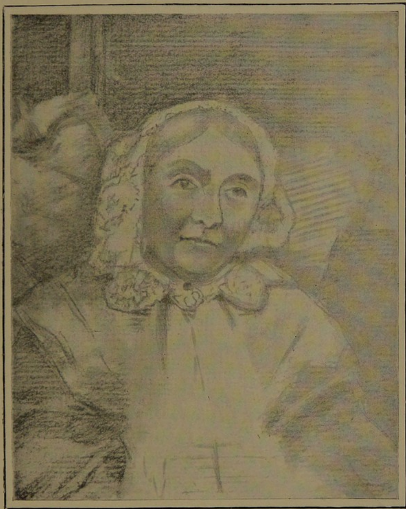
Florence Nightingale in her Last Days.

(From a drawing from memory.)