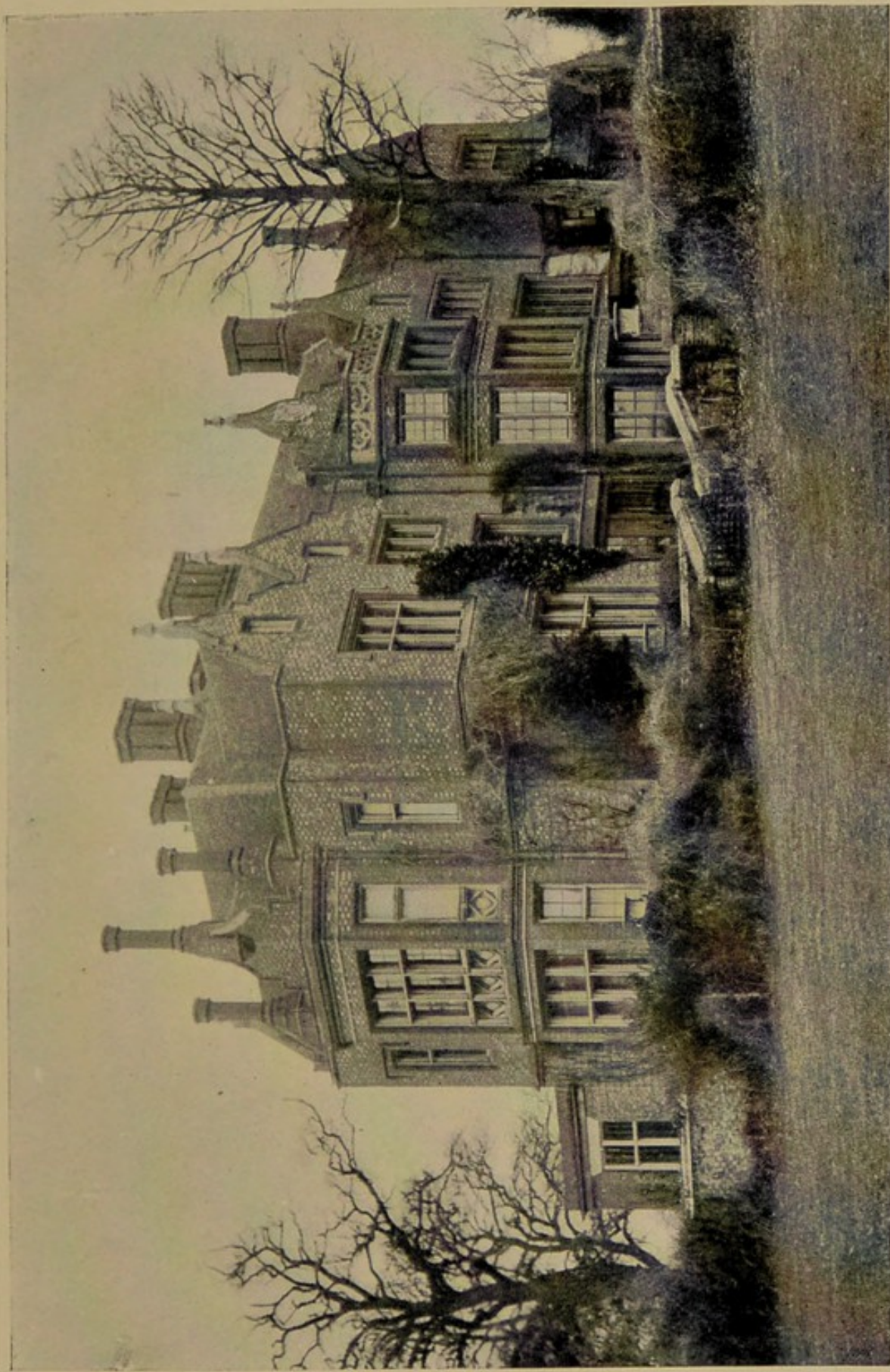
Florence Nightingale's Home, Embley Park, Romsey, Hants.