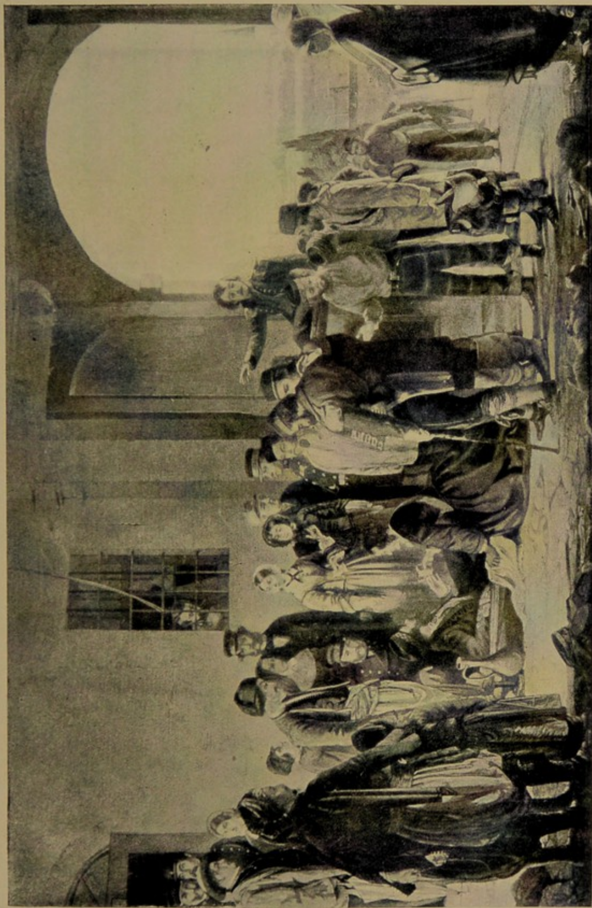
“A Mission of Mercy.” Florence Nightingale at Scutari.