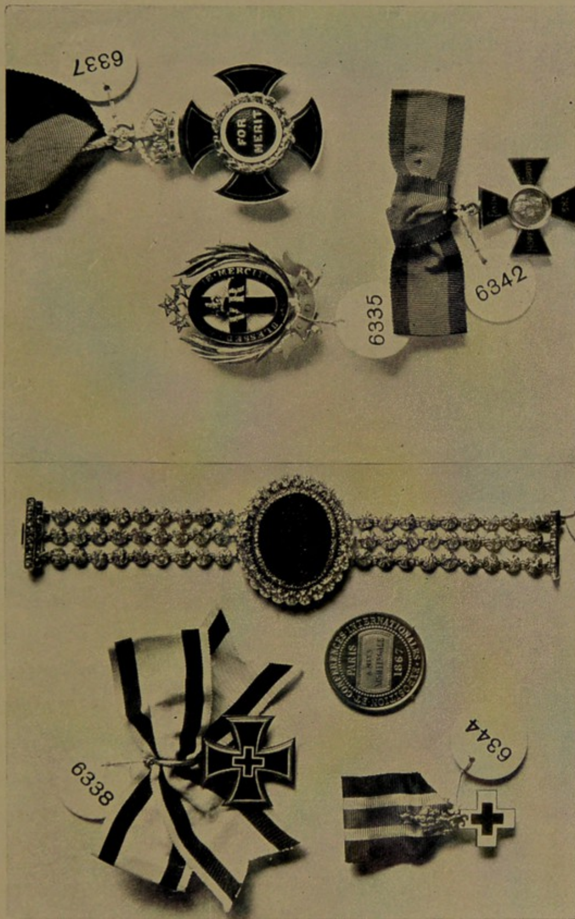
Miss Nightingale's Medals and Decorations.