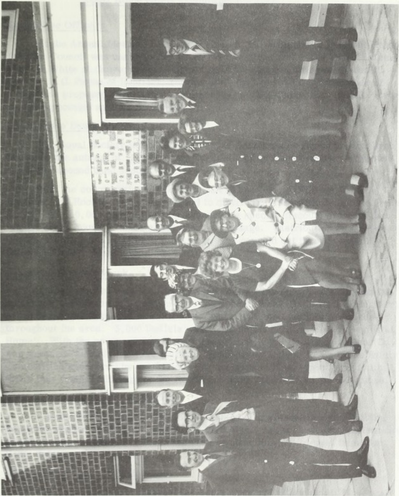
SOUTH EAST ESSEX HOME SAFETY COMMITTEE at Amelia Blackwell House, Canvey Island, (Sheltered Unit for the Elderly) October, 1972