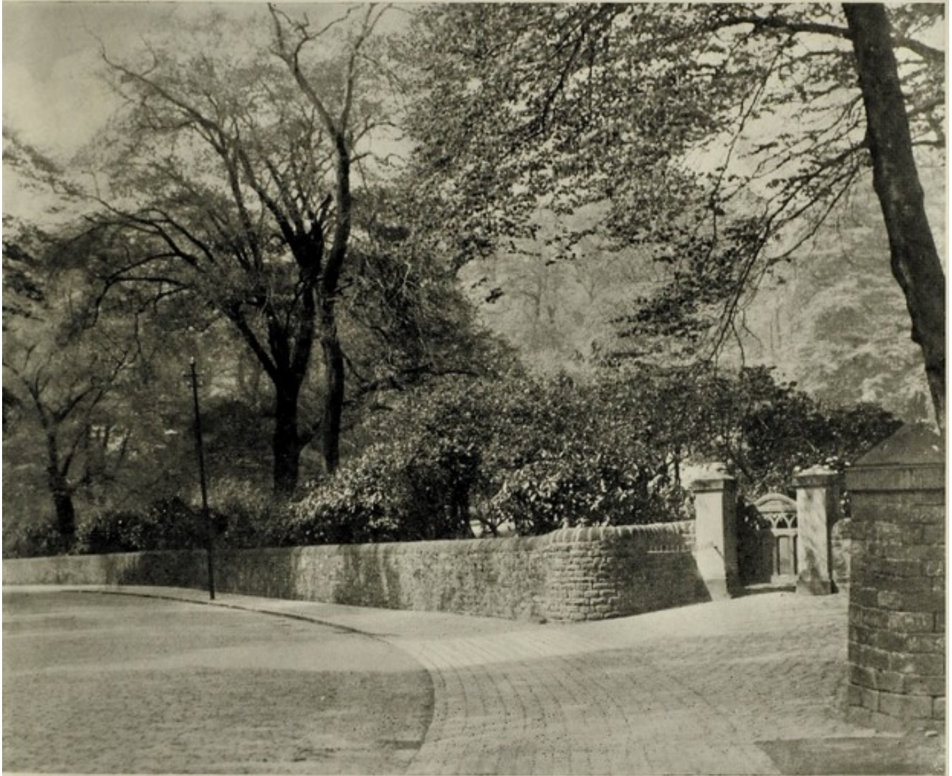
Rural Scene at Broadclough