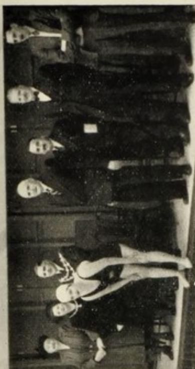
THE MADEN PUBLIC BATHS following extensive renovations and installation of Chlorination Plant