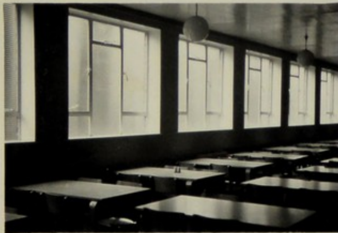
A MODERN CANTEEN AT A FACTORY ON THE AUDENSHAW INDUSTRIAL ESTATE.

ONE OF THE MANY IMPROVEMENTS MADE BY THE INDUSTRIALISTS OF THE DISTRICT DURING THE YEAR.