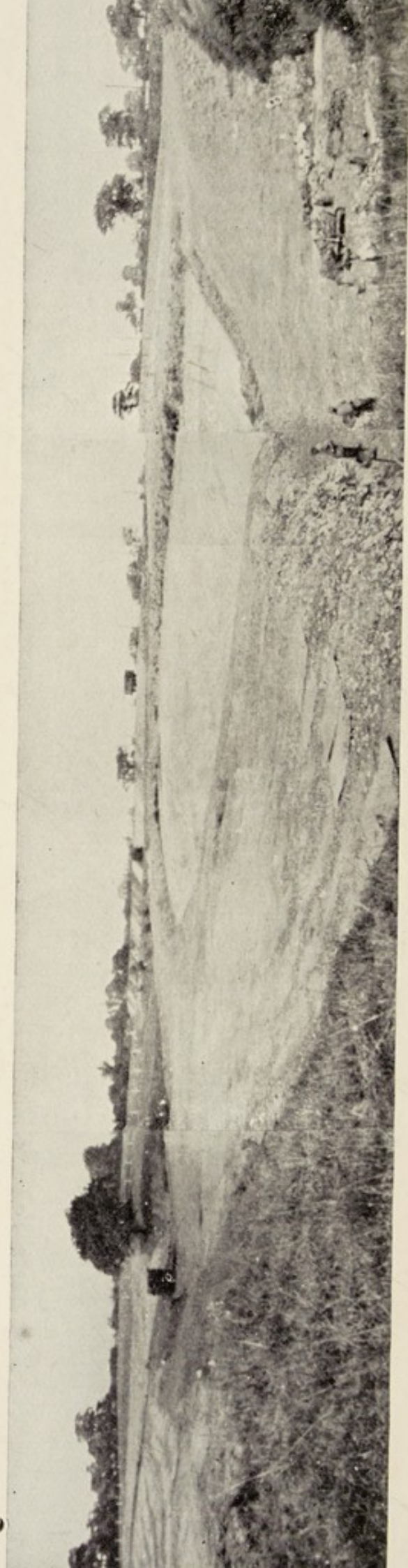
VIEW OF TIP EXTENSION 1947