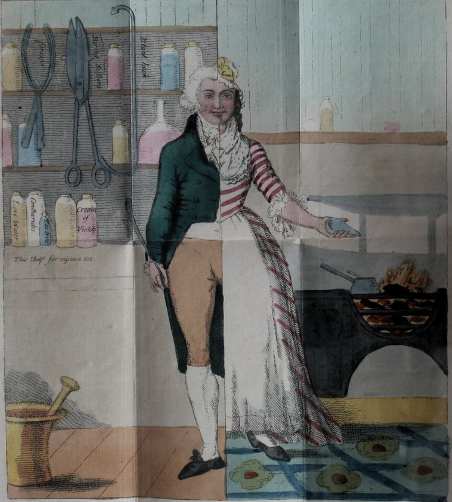
This Shelf for my own use.