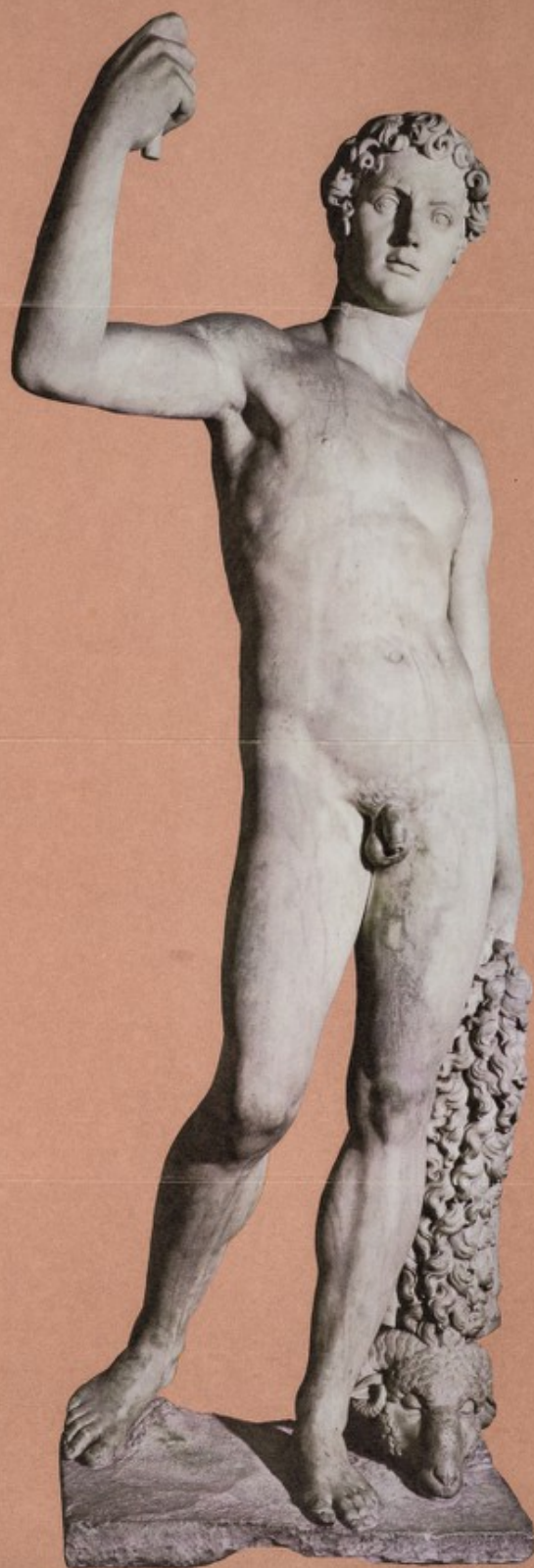
'Jason' Ascribed to Giovanni Bandini Italian, Late 16th century.

Ointment the classic answer to dry, scaling dermatoses