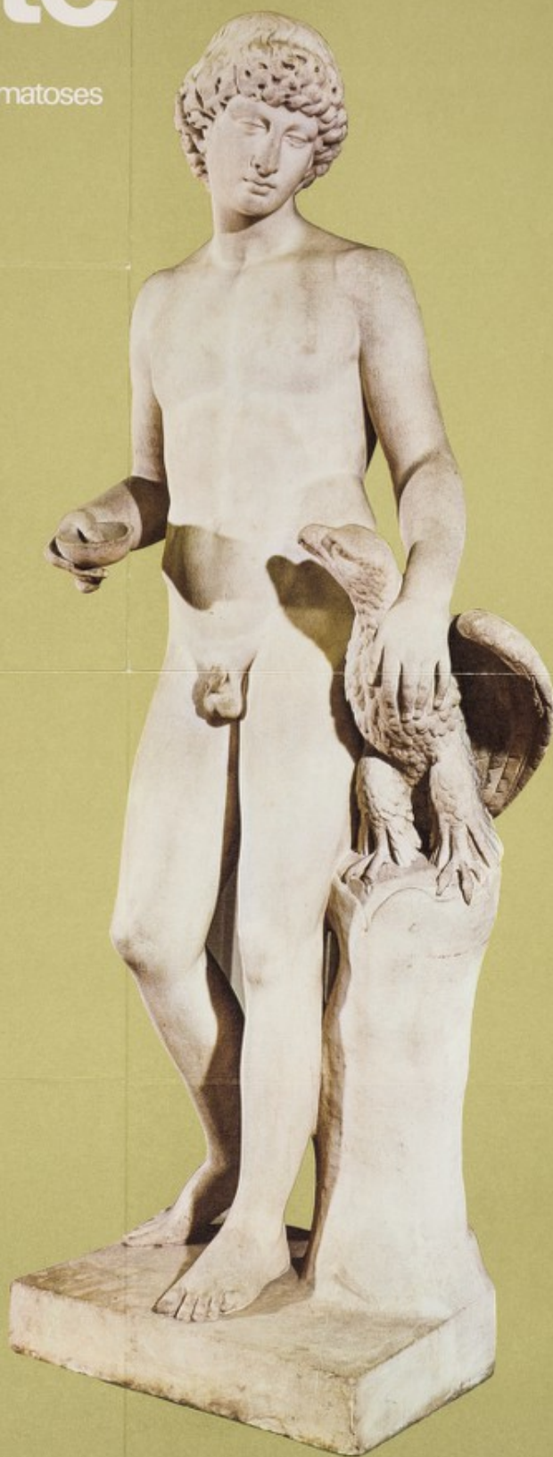
'Ganymede', Marble. Signed by Guillaume (II) Coustou (b. 1716-d. 1777). French. Third quarter of the 18th century.

Cream the classic answer to moist, weeping dermatoses