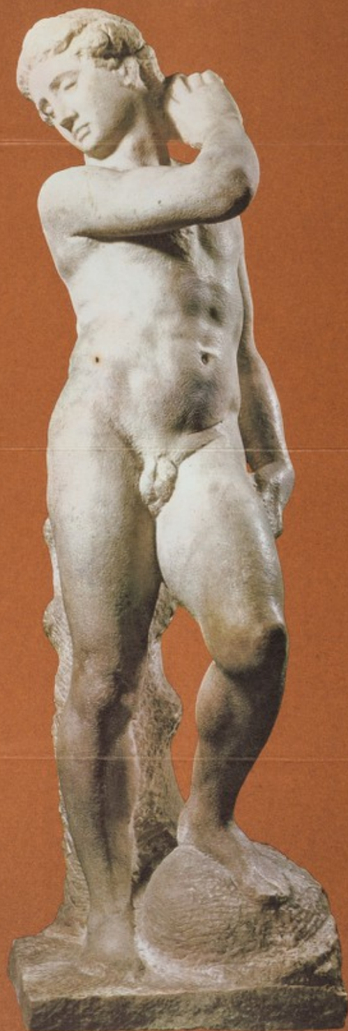
Michelangelo 'David' Florence, Bargello

Contact dermatitis cleared in seven days with Betnovate Cream