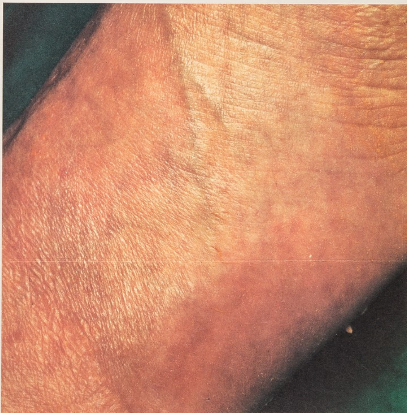
Clearance after a week's treatment three times daily with Betnovate-C Ointment.