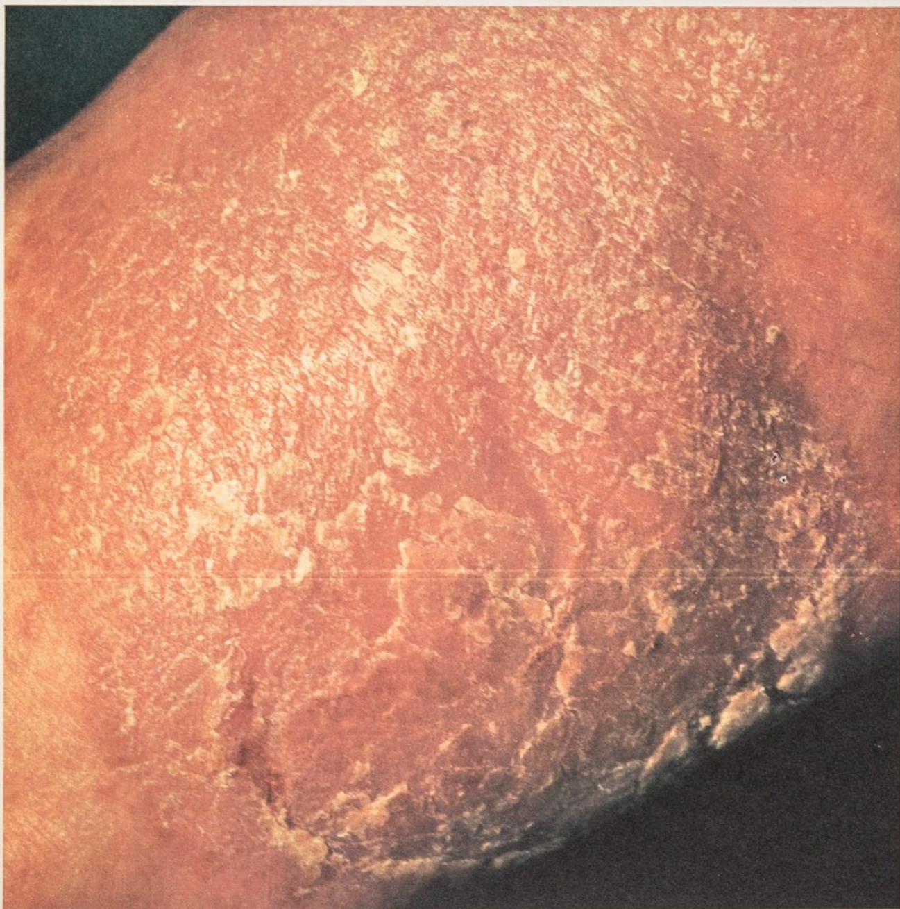
Exacerbation of eczema on side of foot, a site liable to infection when skin is broken.