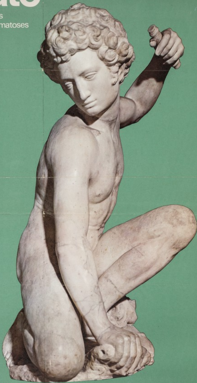
'Narcissus' Marble Italian (Florentine) Second half of the 16th century

Betnovate-N and Betnovate-C Creams classic answers to moist infected dermatoses