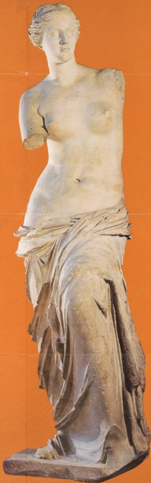
"Venus de Milo" 100 B. C. Found on Melos Louvre, Paris

anti-infective preparations classic answers to infected dermatoses