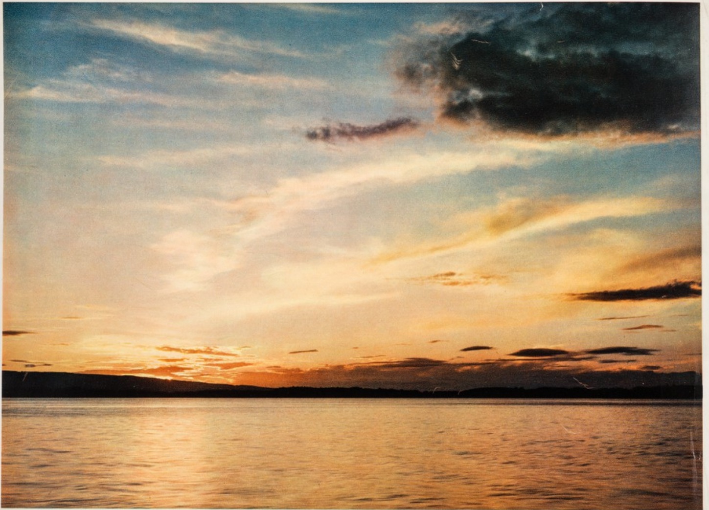
Sunset on the Lake of Zug (Switzerland)