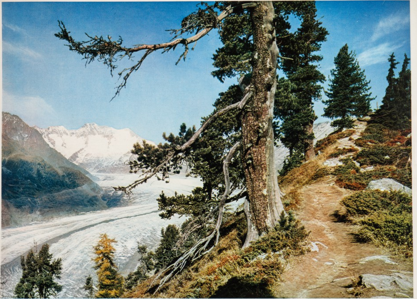
The Aletschglacier and Fiescherhörner (Swiss Alps)